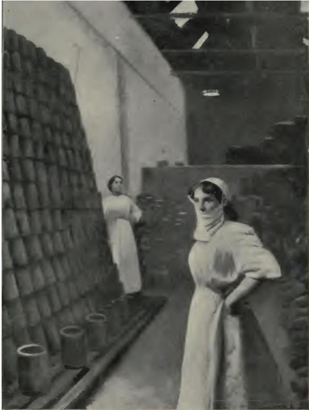
Fig. 5.1. Harold Piffard's picture of "A corner of a white lead factory". Public domain

“This stuff came in wooden barrels containing two hundredweight and he used to have to dig it out of these barrels with a trowel and put it into a metal tank, where it was kept covered with water and the empty barrels were returned to the makers. When he was doing this work he usually managed to get himself smeared all over with the white lead...”