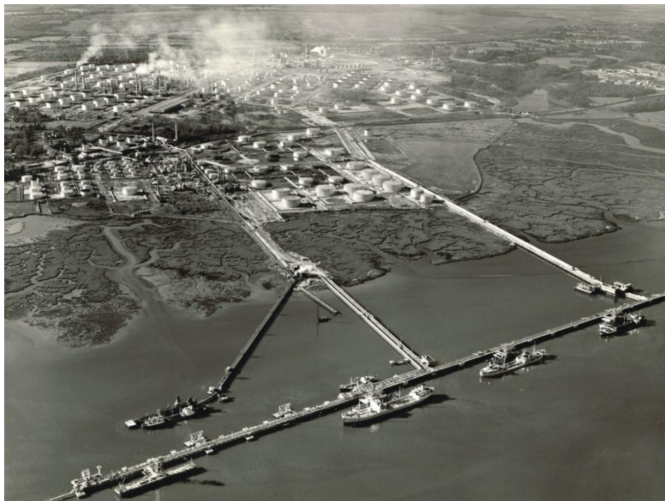
Fig.10.1. Esso refinery and Fawley marine terminal, 1958. This was the year in which Esso appointed its first occupational hygienist in the UK. In later years Esso hygienists made important contributions to occupational hygiene nationally.