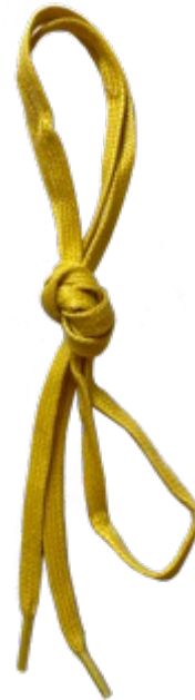
Laces from cotton