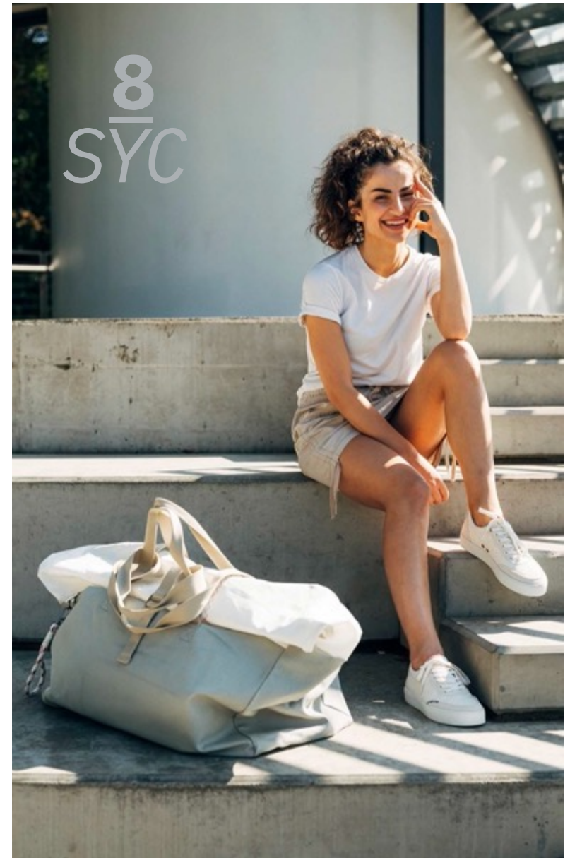
Bornholm Island grey/white