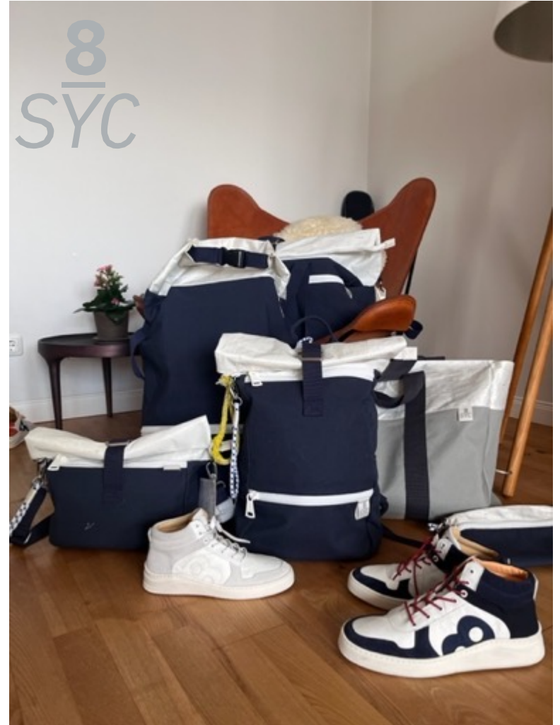
Bornholm Island navy/white