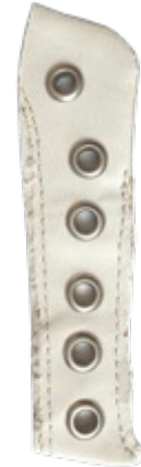
Eyelets on recycled sail