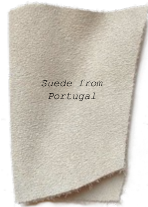
Suede from Portugal