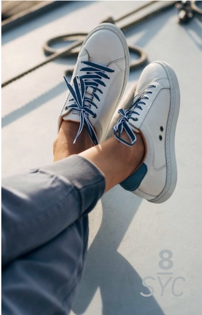
Anuta Island ocean