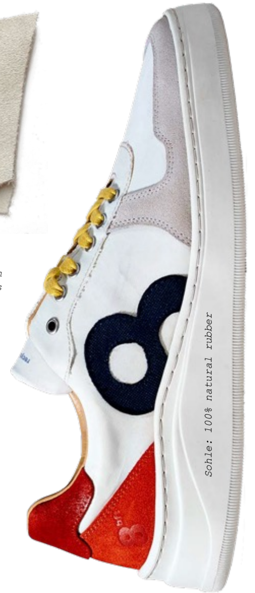
Sohle: 100% natural rubber