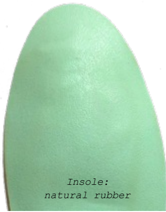
Insole: natural rubber