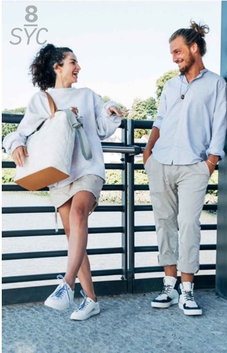
Bora Bora Island white