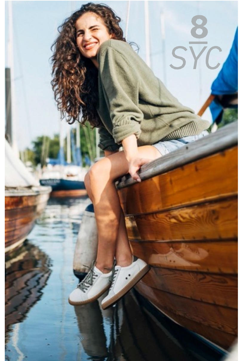
Anuta Island olive