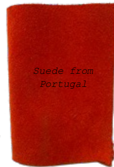
Suede from Portugal