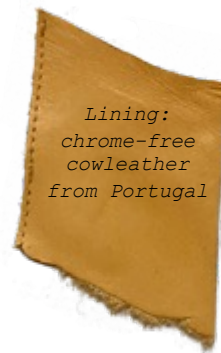
Lining: chrome-free cowleather from Portugal