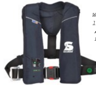
Waste from life vests ,Secumar' from Holm