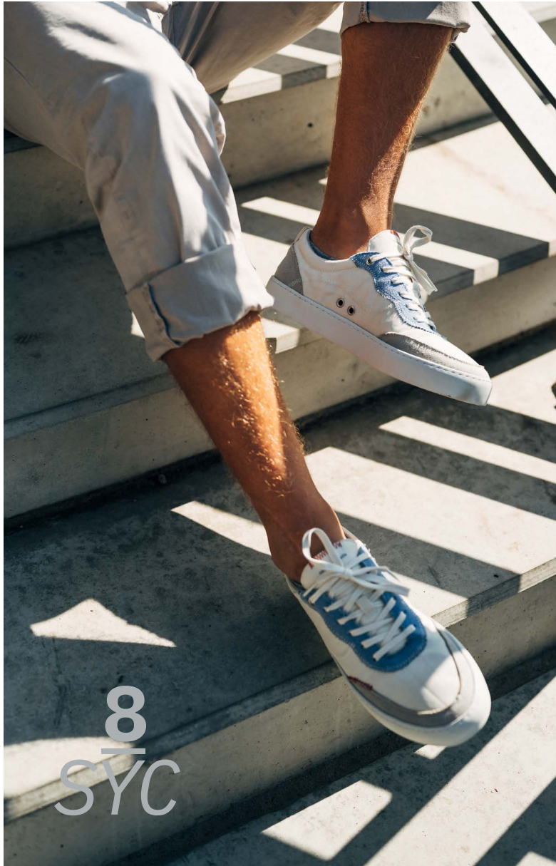
Block Island baltic