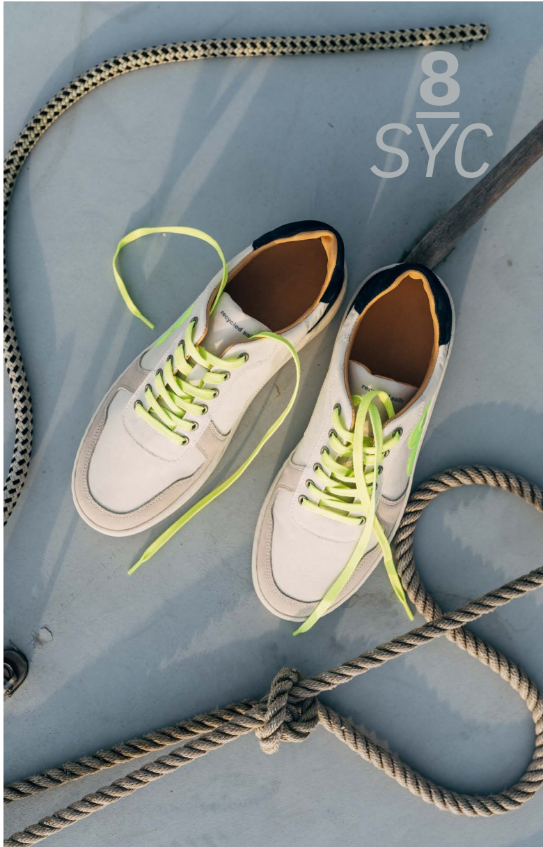
Galapagos Island lime