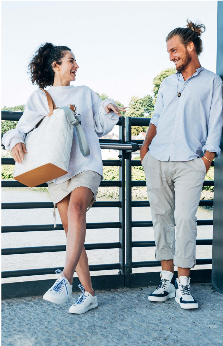
Bora Bora Island white