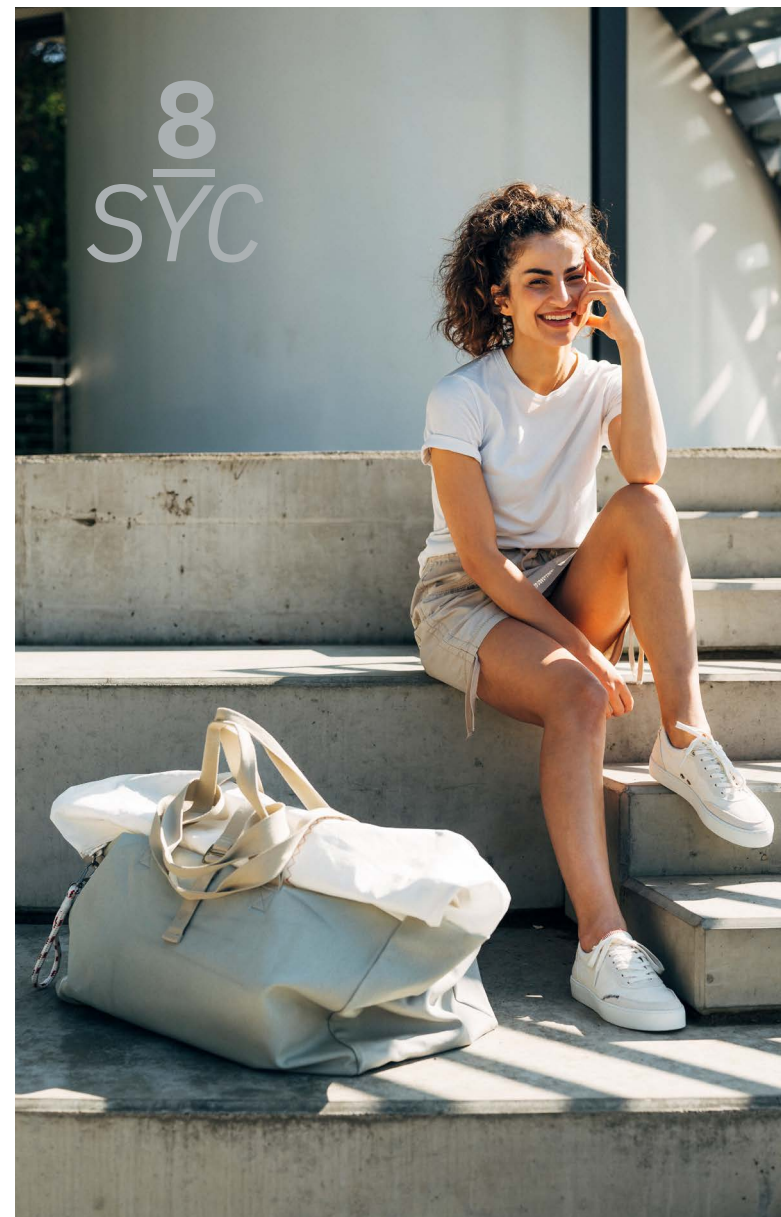
Bornholm Island grey/white