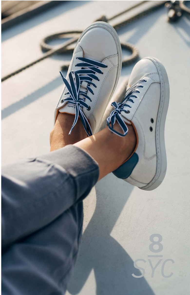
Anuta Island ocean