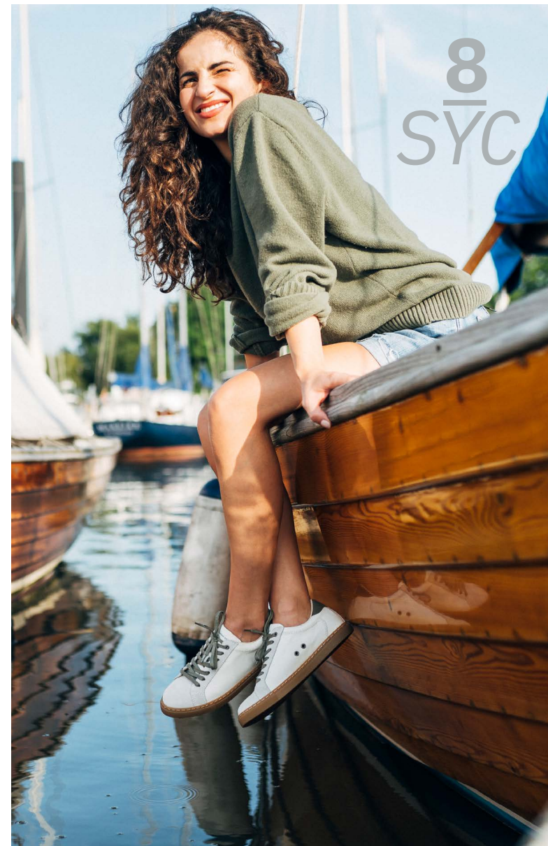
Anuta Island olive