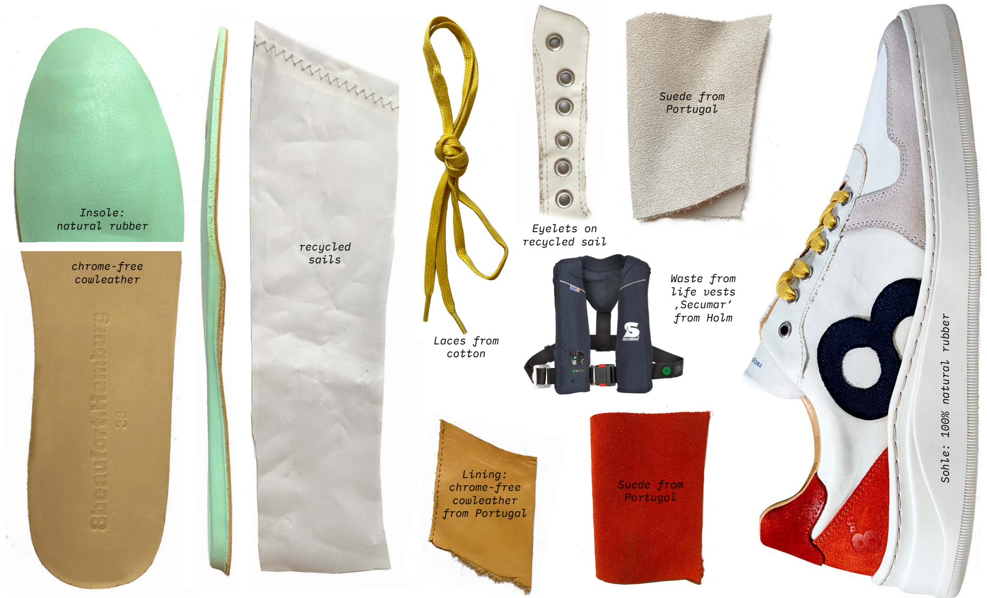
Galapagos Island signal