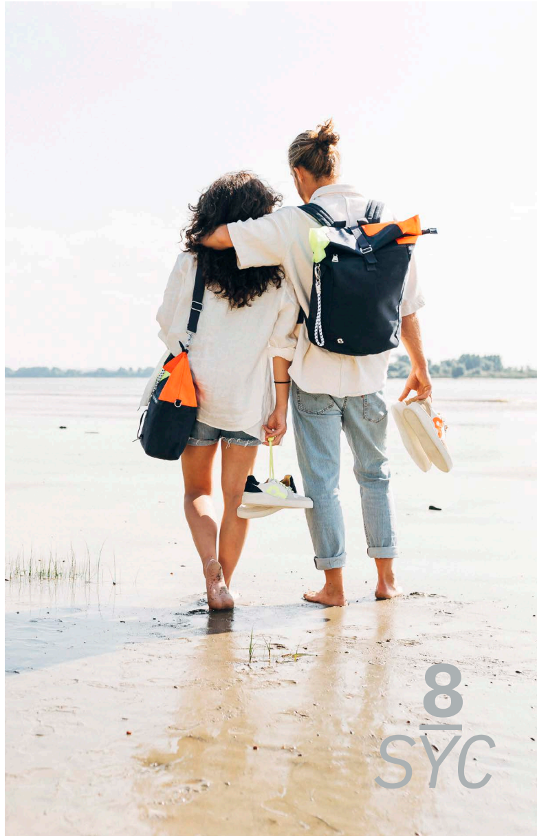
Bornholm Island signal