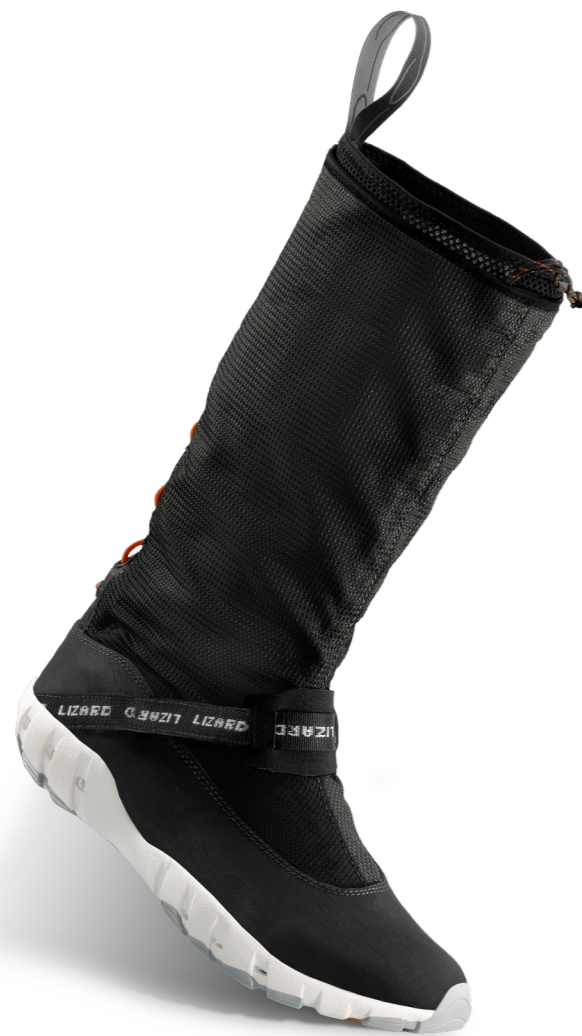
0020 dark grey