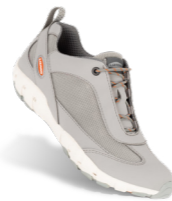
0019 grey HC