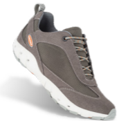
0020 dark grey