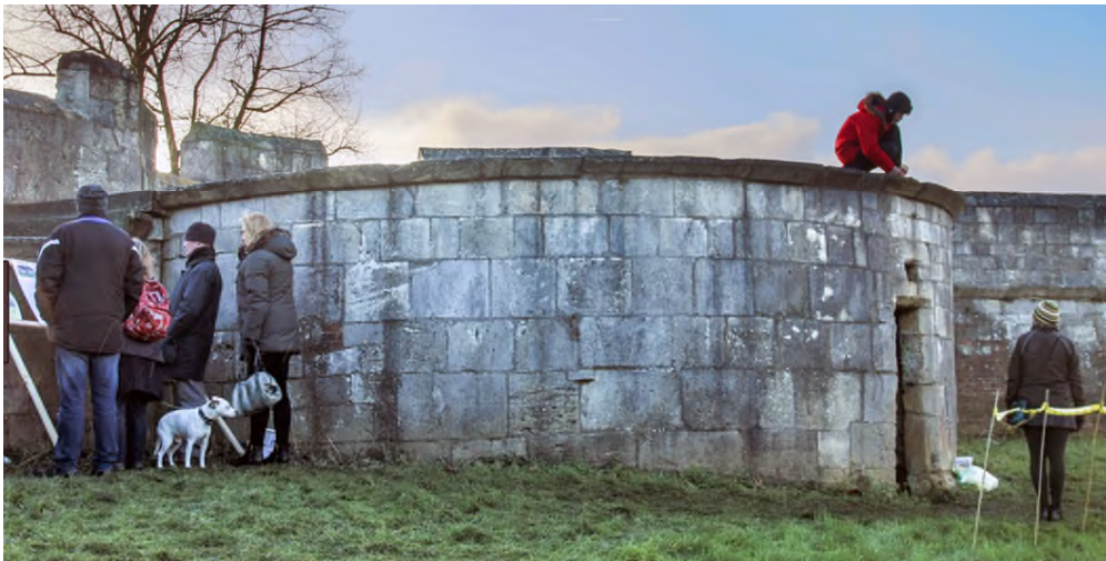
Bitchdaughter Tower

News that several towers of the City of York Walls are to be repaired led to a perusal of some names. One was called Bitchdaughter Tower and another Harlot Hill Tower. What history produced such gems?