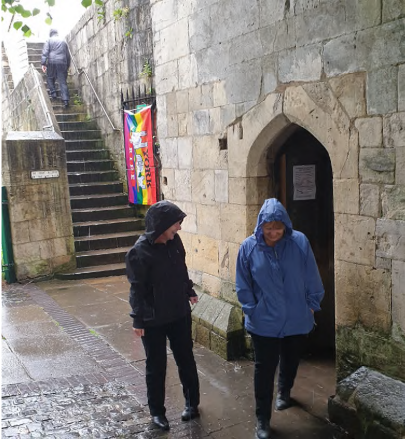
Soggy Visitors to the Tower

Our most recent opening (Sat 8th June) was very wet! Our sales pitch switched to "It's dry inside!".