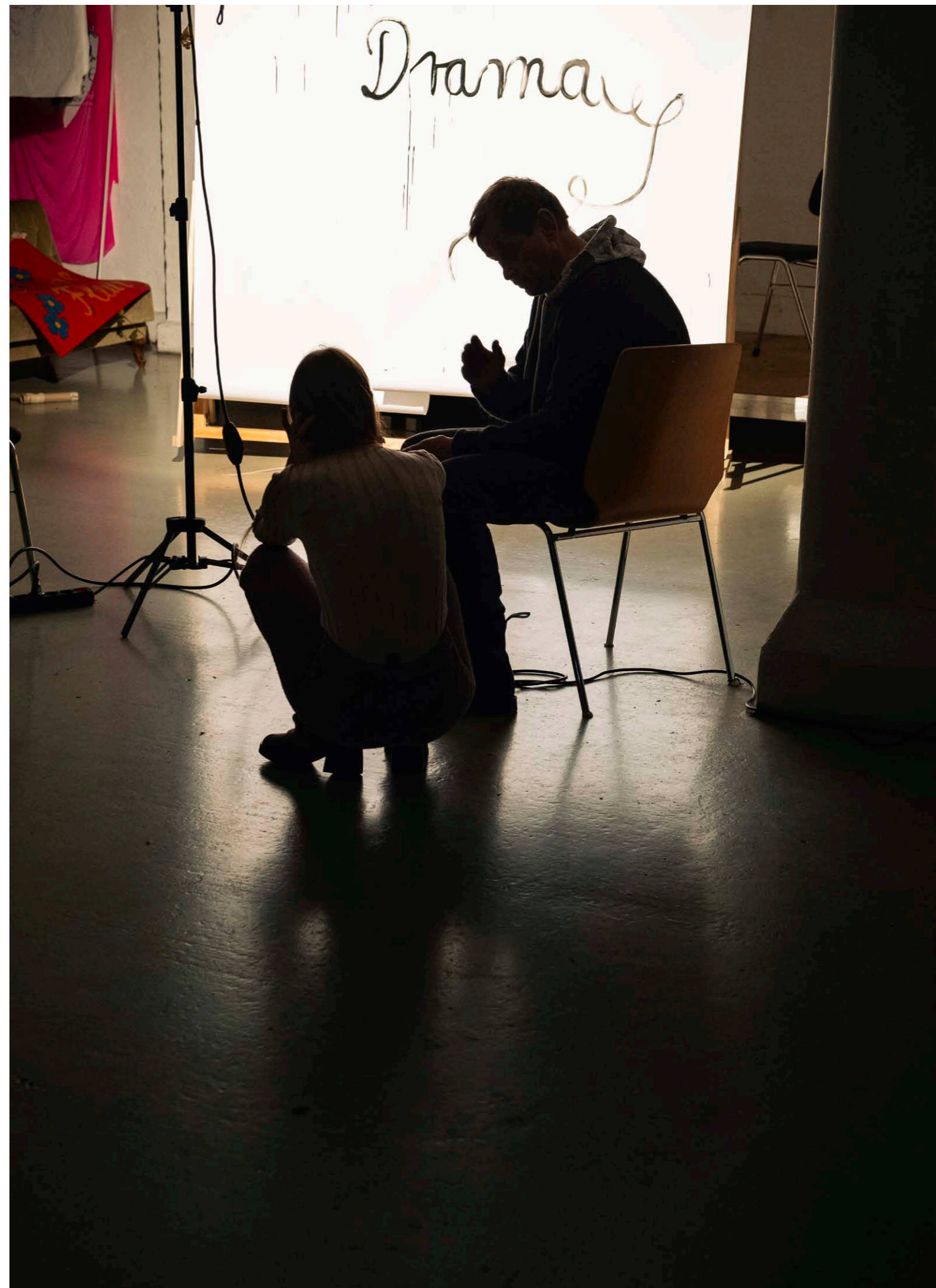
Drama, Workshop documentation of HfK Bremen master program, 2022