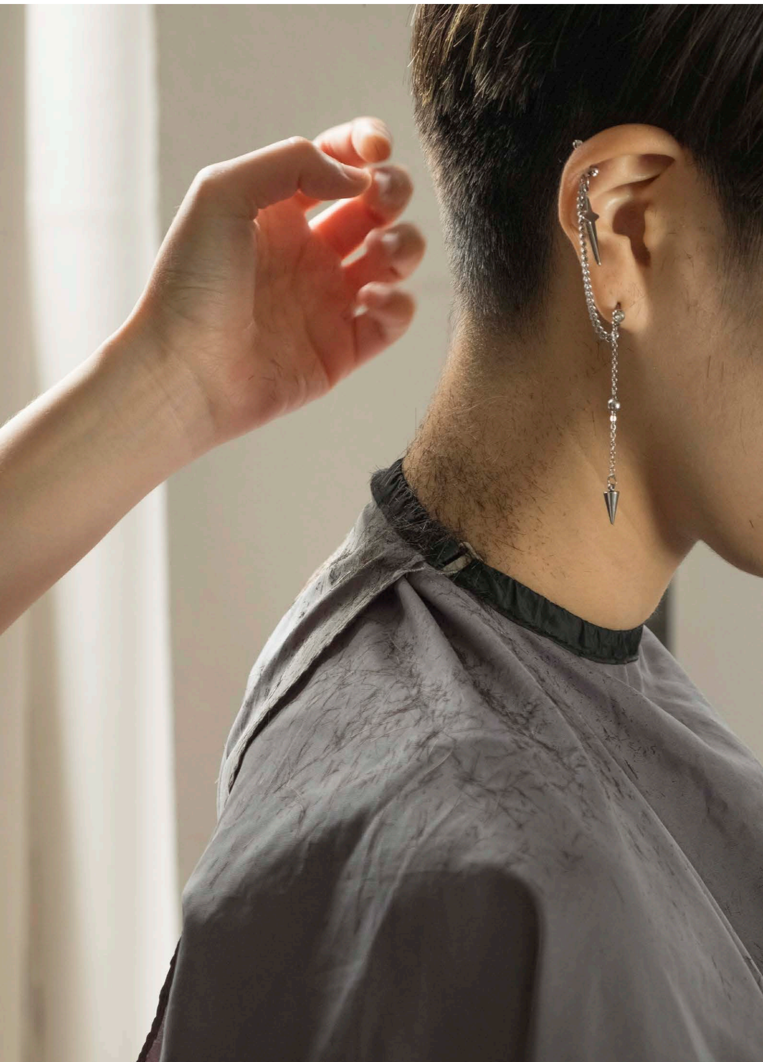
Nöhe #7, Free work, 2021