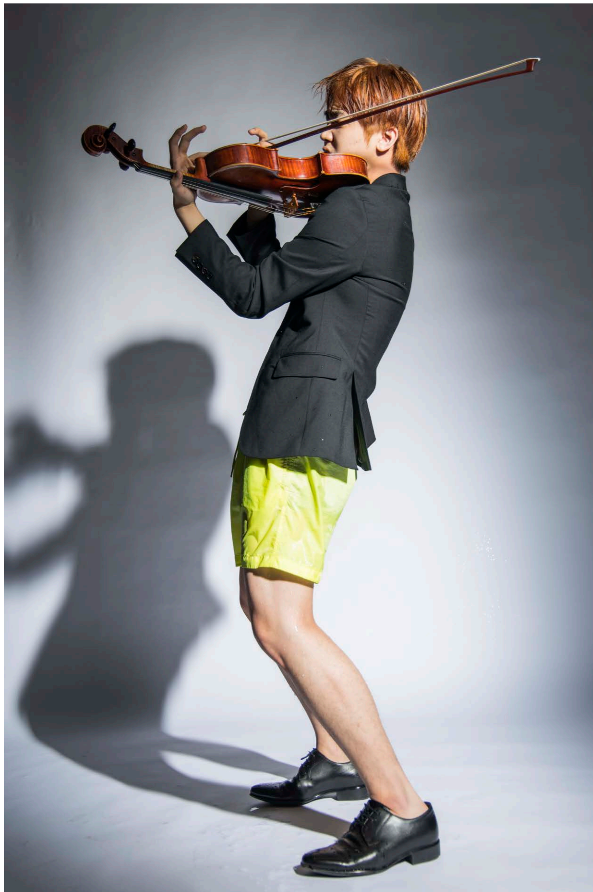
Violist Dong-In Lahr, Profile work, 2019