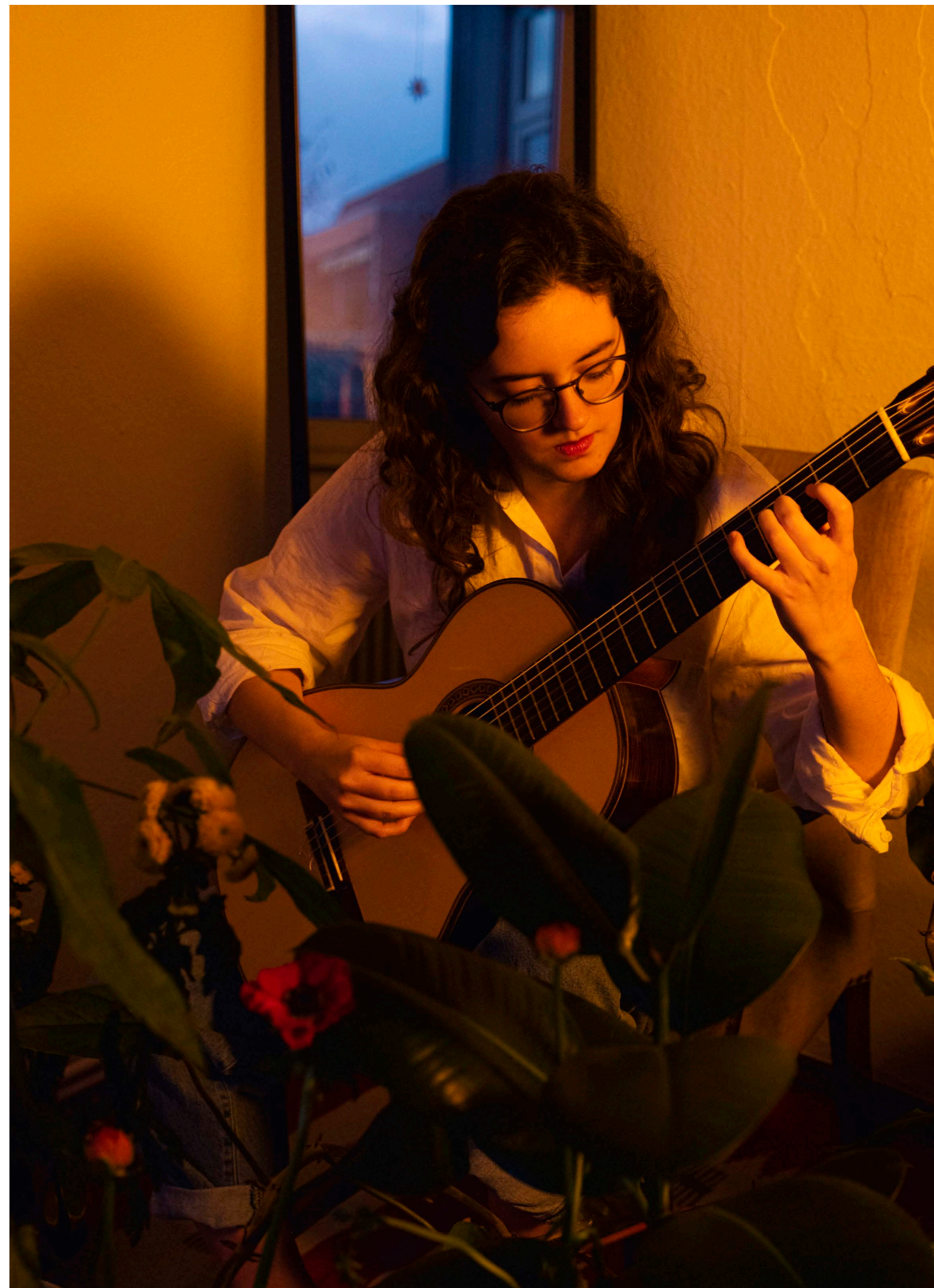
Classic Guitarrist Isa Kleinhempel, Profile work, 2023