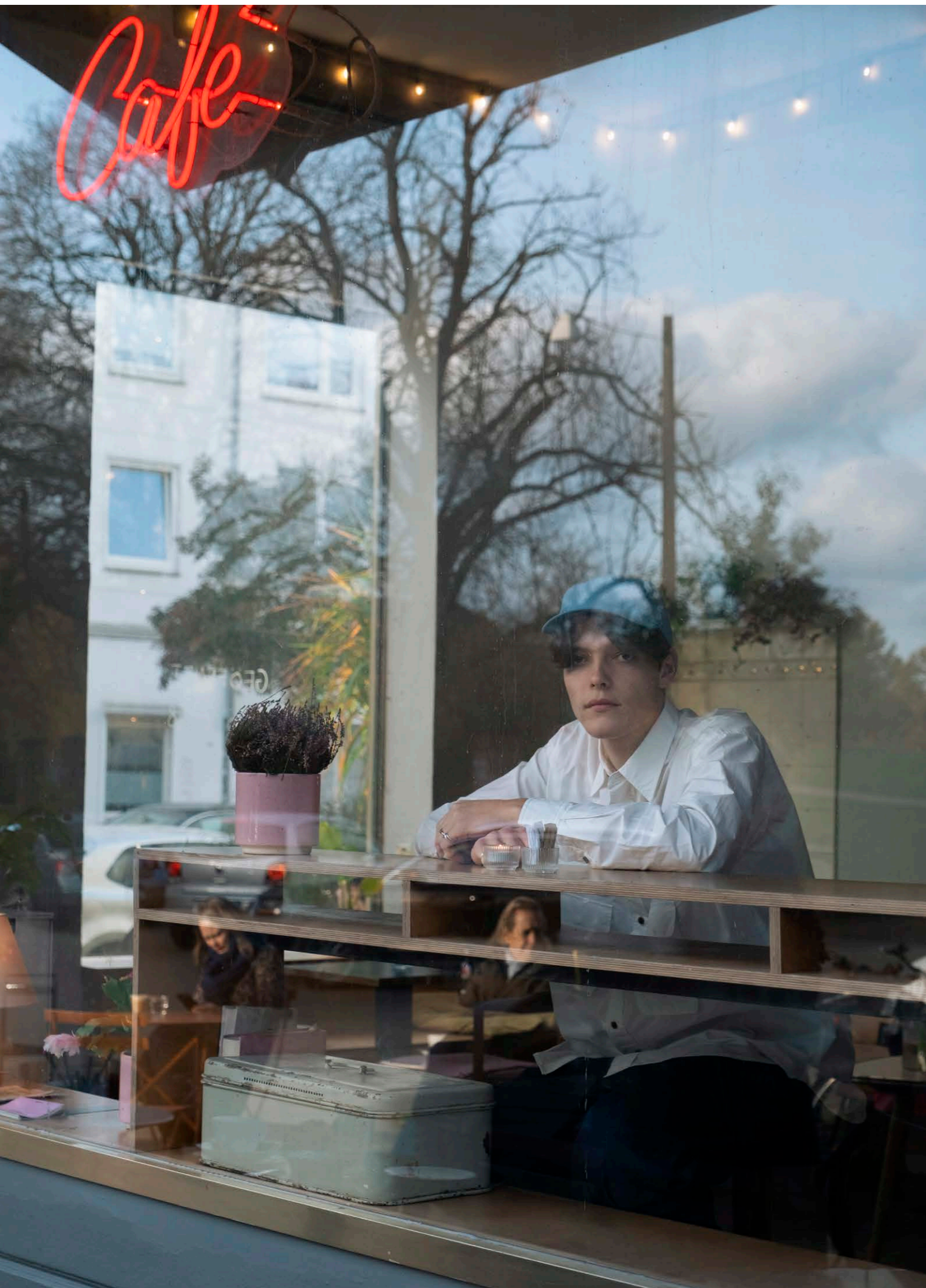
Around #8, Collaboration with fashion label Dublin Ware, 2023