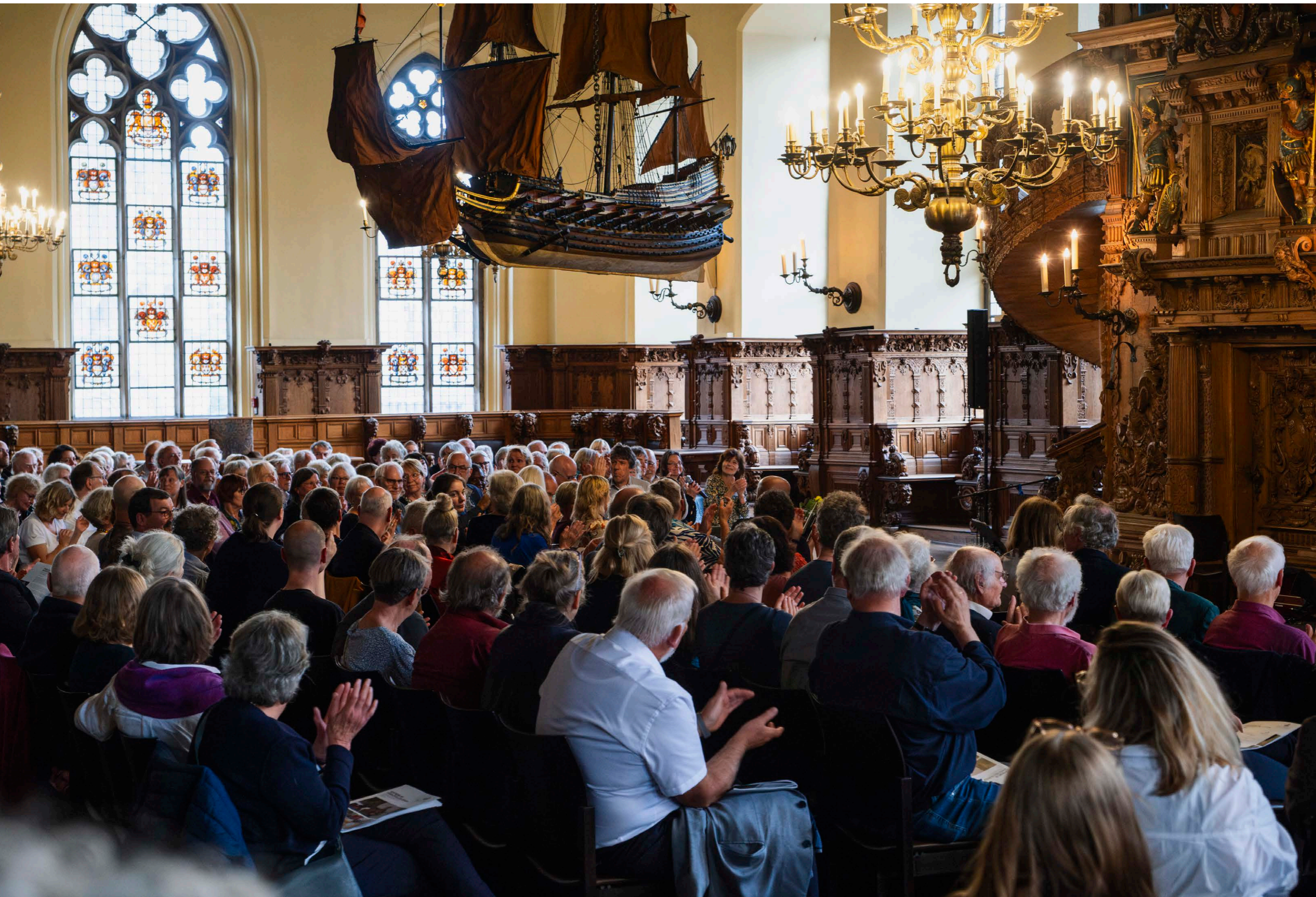
International Bremer Peace Award, Press work, 2024