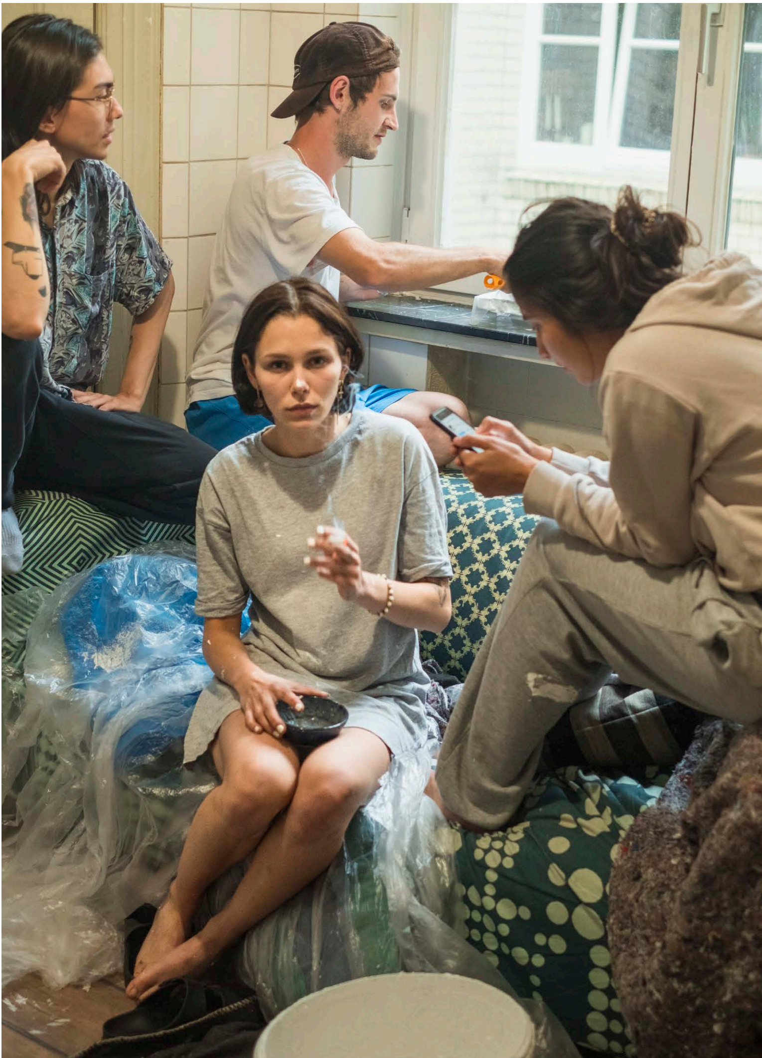
Nähe #40, Free work, 2021