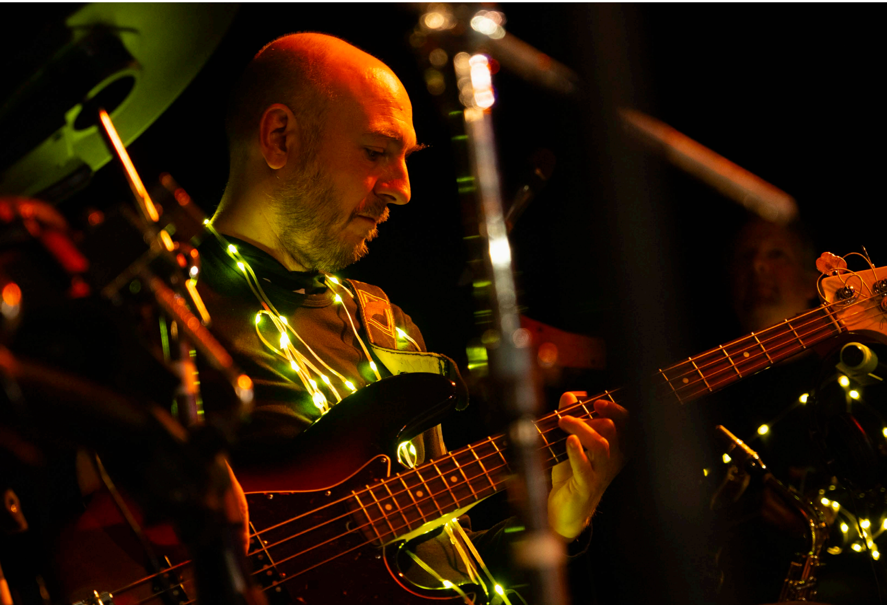
The Bassist, Documentation of Klassiker Circus, 2024