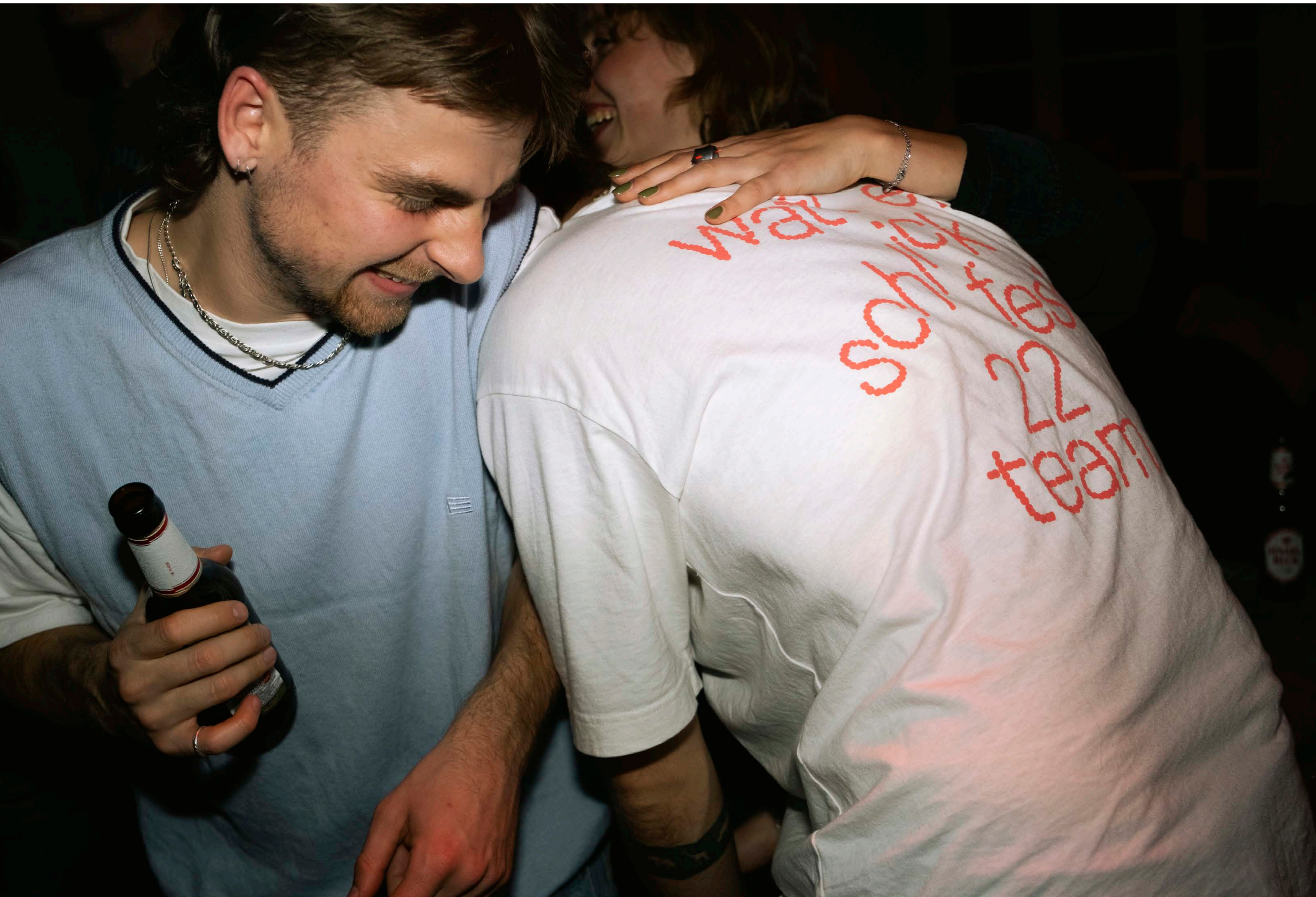
Cuddling, Documentation of "Breathe Vo.5" release party, 2022