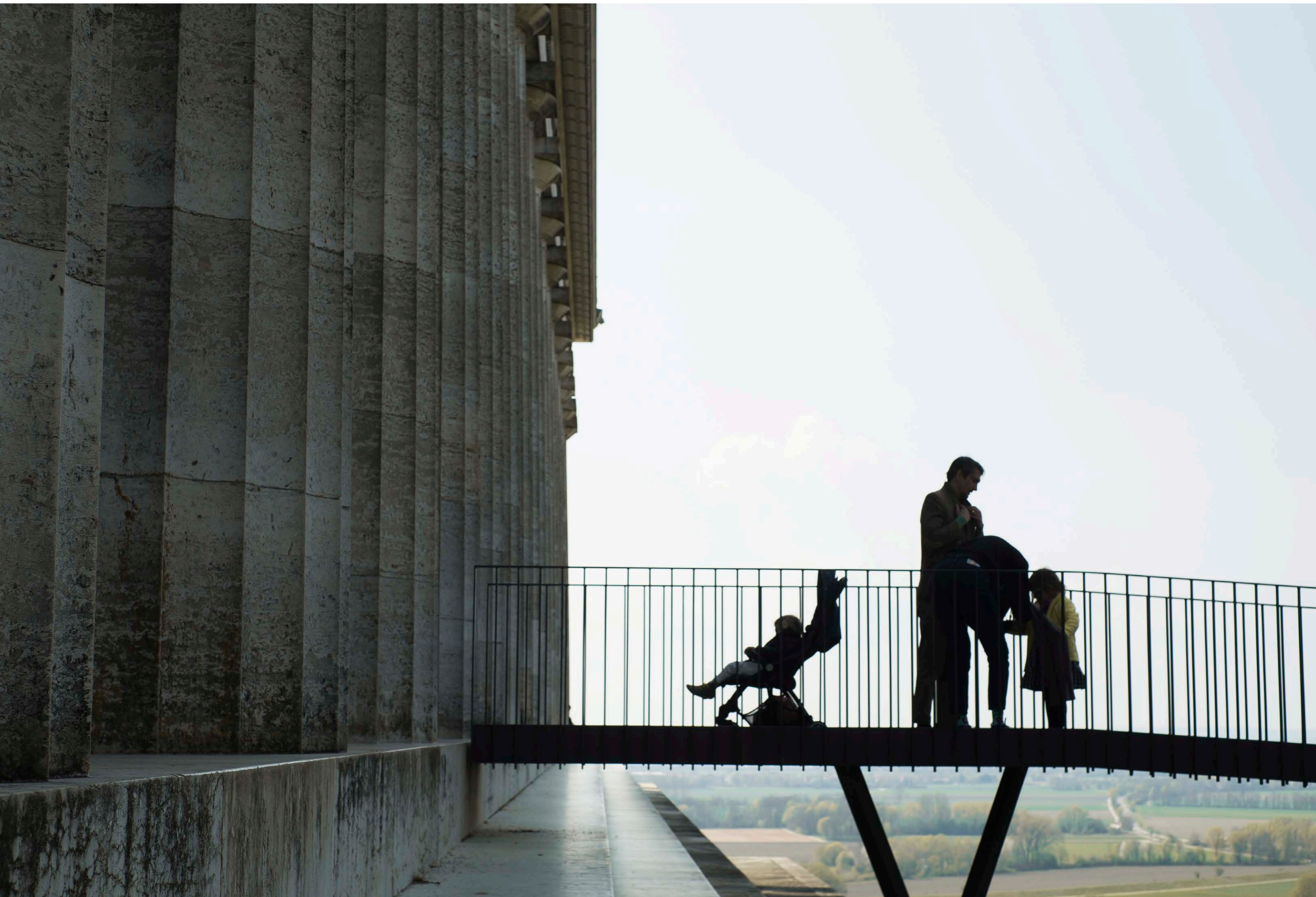
At Wallhalla, Donaustauf, Free work, 2022