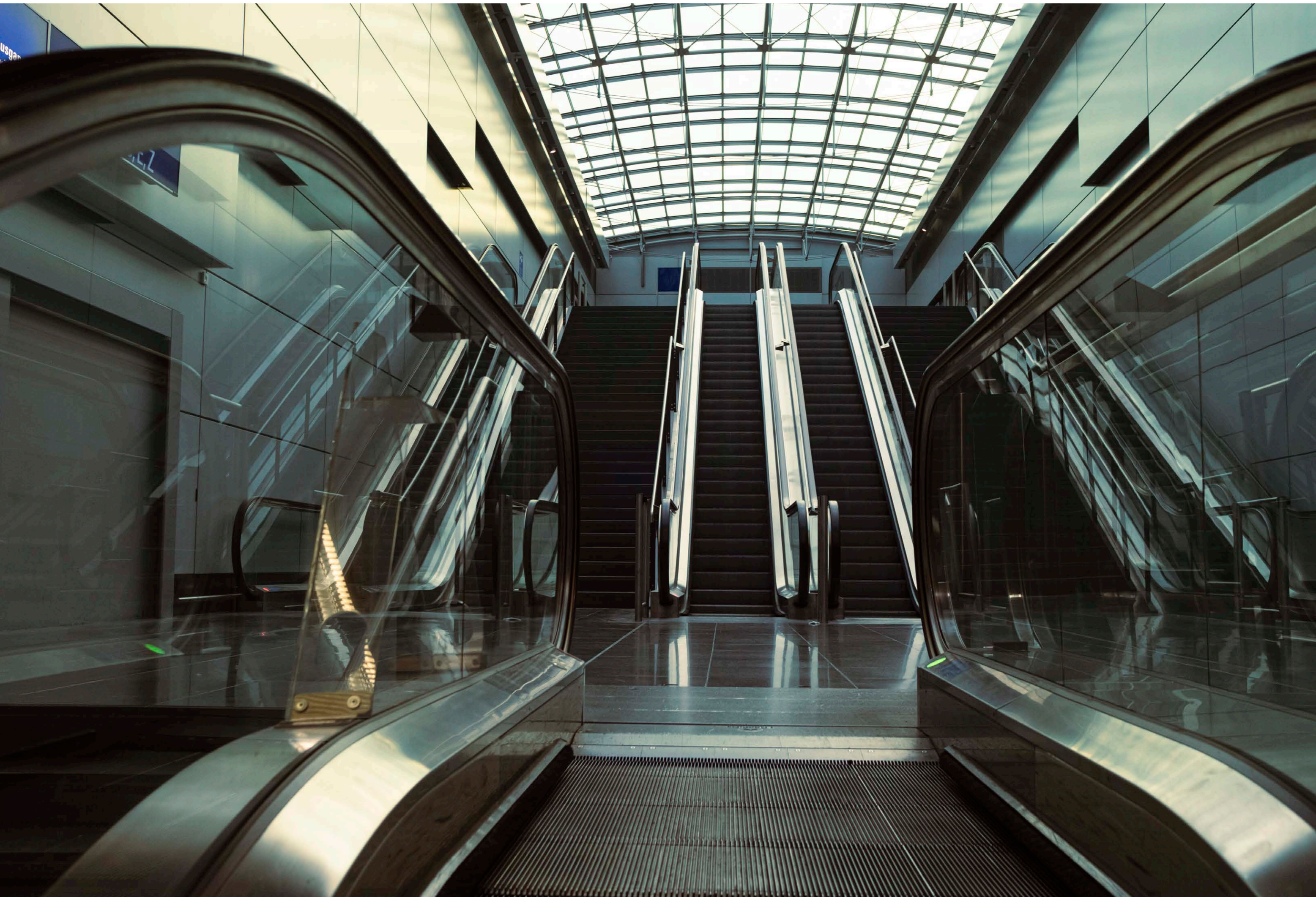
Frankfurt International Airport, Free work, 2022