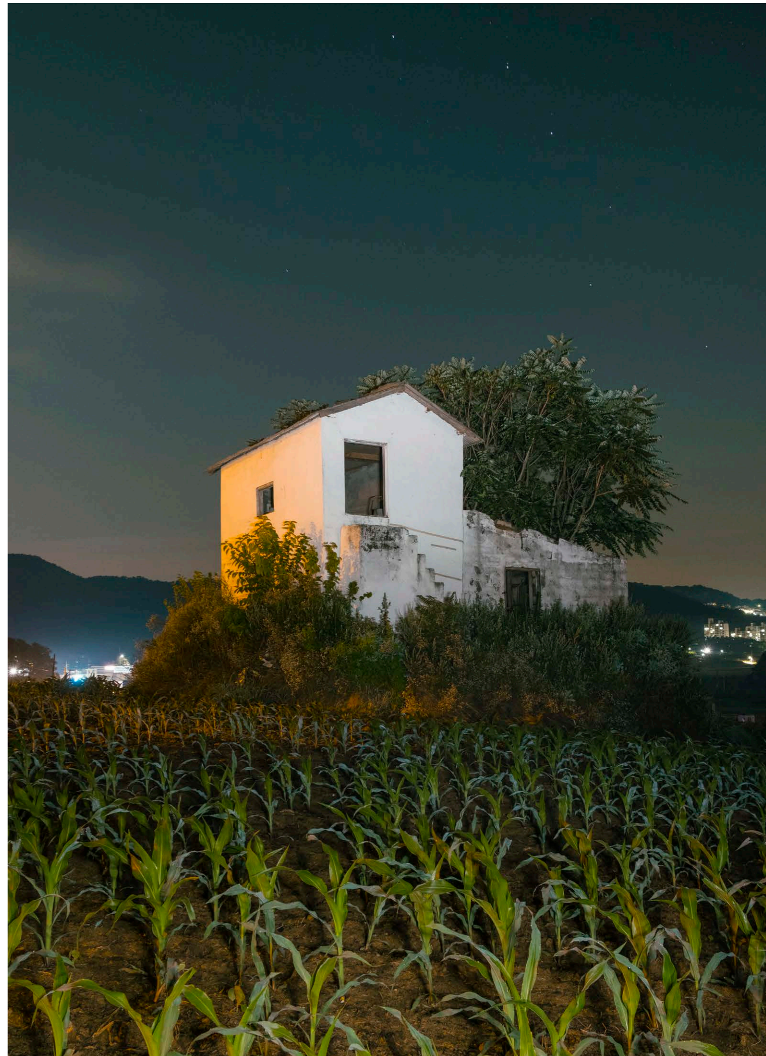
What Is Far Away Will One Day Become A Longing #20, Free work, 2020