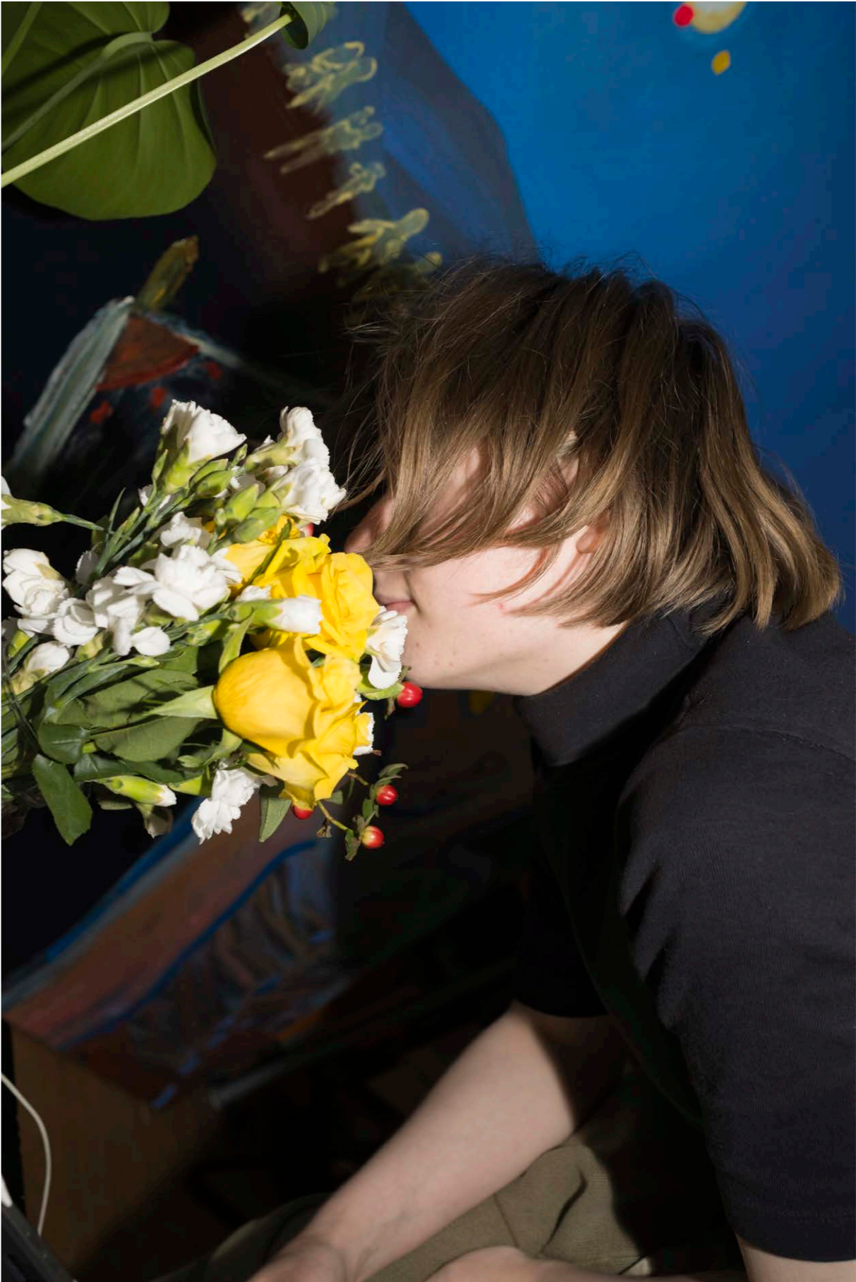
Nähe #27, Free work, 2021