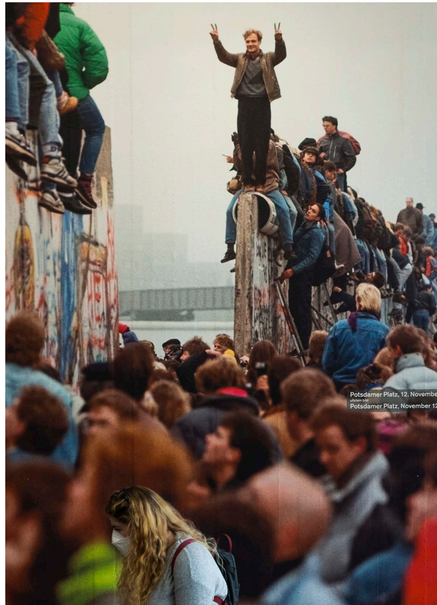
Potsdamer Platz, 12. November Potsdamer Platz, November 12,