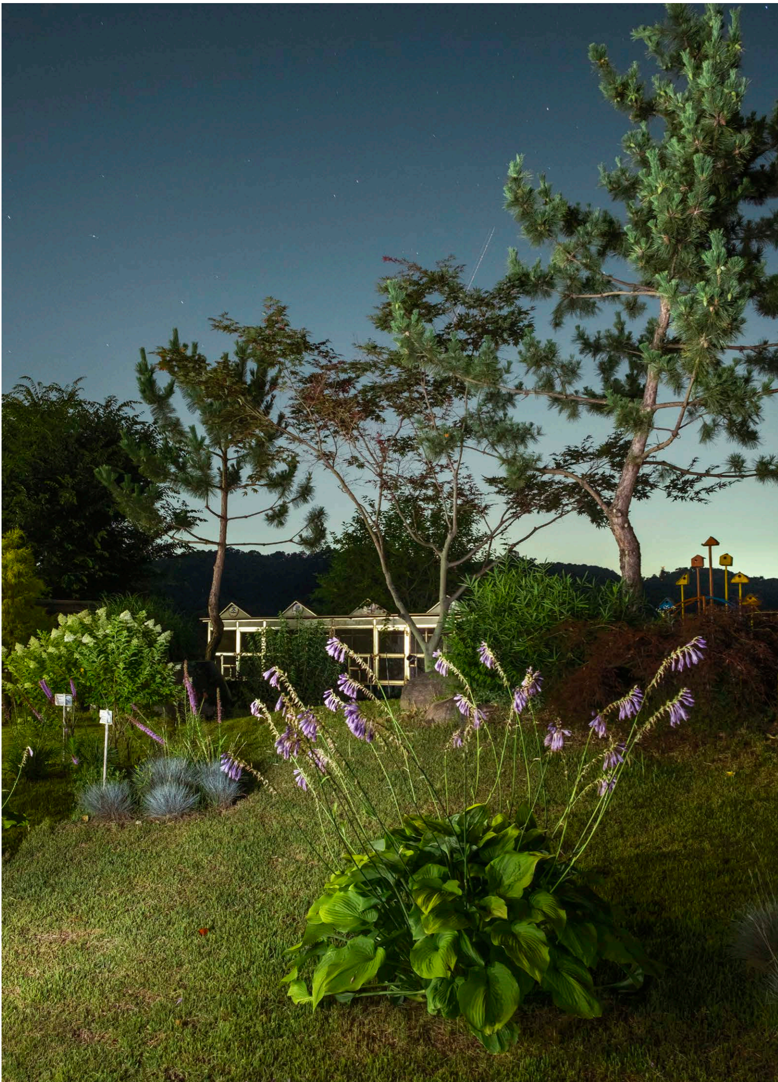
What Is Far Away Will One Day Become A Longing #19, Free work, 2020