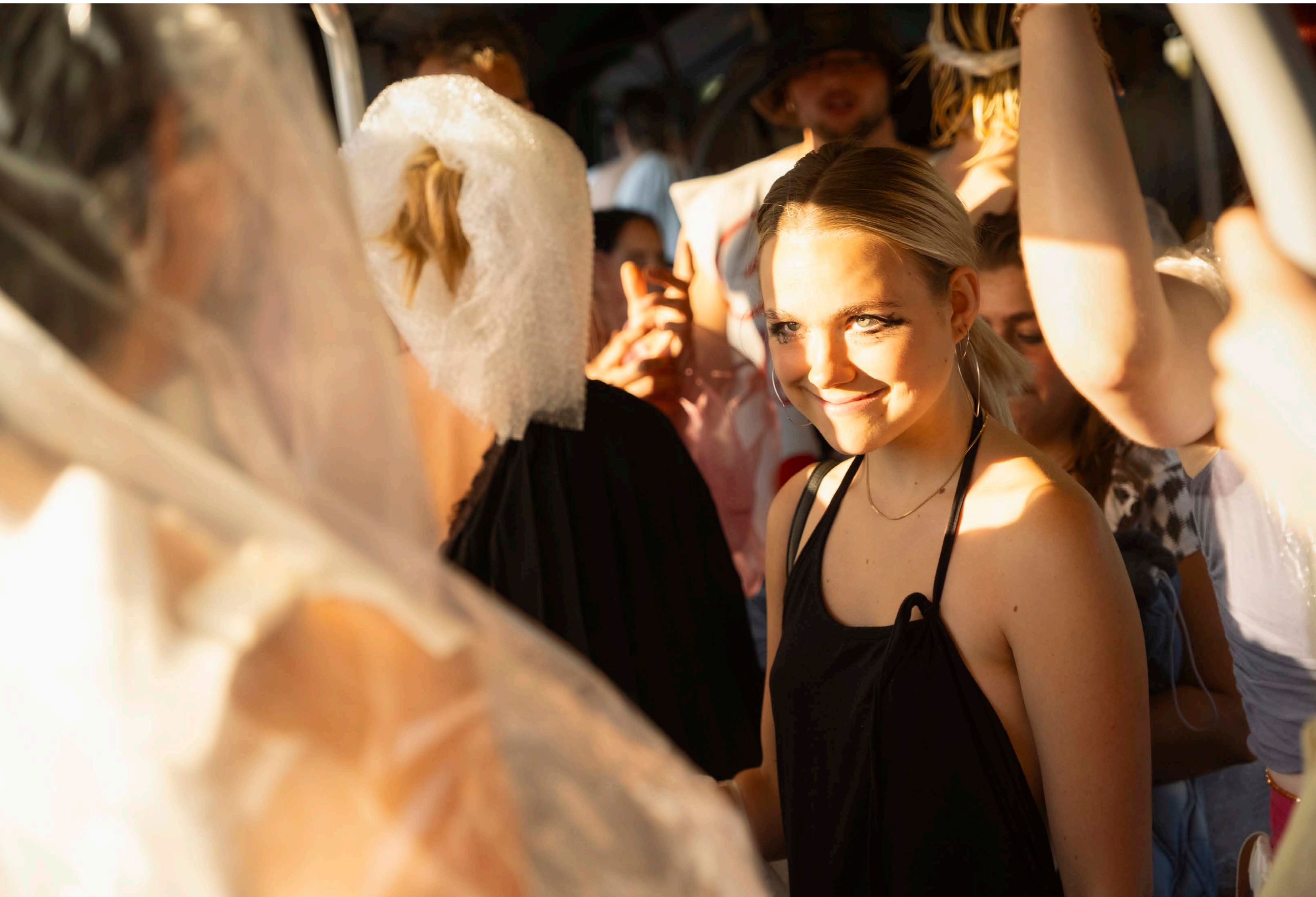
In The Bus Driving To Waller Sand, Back stage documentation of HfK Fashion show, 2023