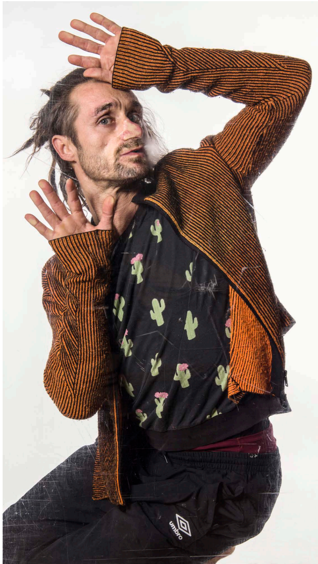
Prison Of Glass, Free work, 2019