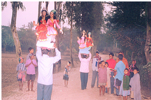
Figure 5. Bonobibi Puja is a great annual community festival in Gosaba Island.

Human-wildlife conflict (HWC), especially human-tiger conflict (HTC) is a regular feature in Sundarban and almost every household in Jamespur and Annpur villages of Gosaba in Sundarban has lost one member to tiger, crocodile or shark attacks (PTI, 2009). Each year about 40 people are attacked by tigers (National Geographic, 2009). There are two types of HTC: inside the forest and outside the forest by straying tigers. The latter has a high potential of retaliatory killing of tigers as well. From 1985 through 2004, about 75 honey collectors were killed by tigers in the forests. In 10 years (2000-2009), 91 people died in tiger attacks, 60 cattle were killed and 73 cases of tiger-straying incidents were reported. There are about 3,000 tiger widows in Indian Sundarban region (Bhattacharya, 2012) and 10,000 in the Bangladesh Sundarban (LEDARS, 2010). The present study is an attempt to highlight the stigma burden (from tiger attack) and social misery of the tiger-widows.