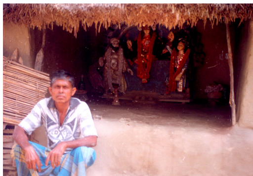
Figure 3. A renowned Bouley of Satjelia GP, who was attacked by tiger twice and narrowly escaped.

network, and almost non-existent electricity (only 17% households have grid connectivity; Centre for Science and Environment [CSE], 2012). Healthcare is poor and inadequate (Chowdhury et al. , 2008a). The main forest-based livelihood activities are fishing, woodcutting, firewood collection, honey, wax, crab and tiger prawn seed (TPS - collection of juvenile prawn, Penaeus monodon ), all of which are potentially life threatening from human-animal conflicts.