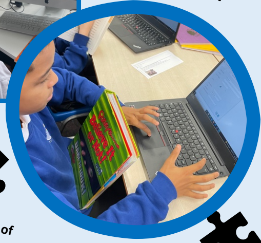
Giving online feedback of each other's videos