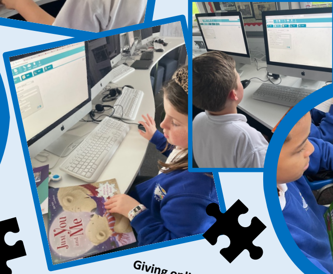
Building our database and adding relevant