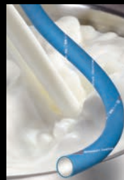
Hoses for milk collecting vehicles