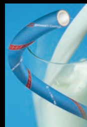
Multipurpose hoses for the food, pharmaceutical and cosmetic industry