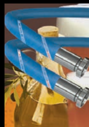
Hoses for the food and beverage industry