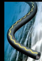
Water hoses for industrial and commercial use

Together with the technical trade, we are developing further hose solutions for your specific application.