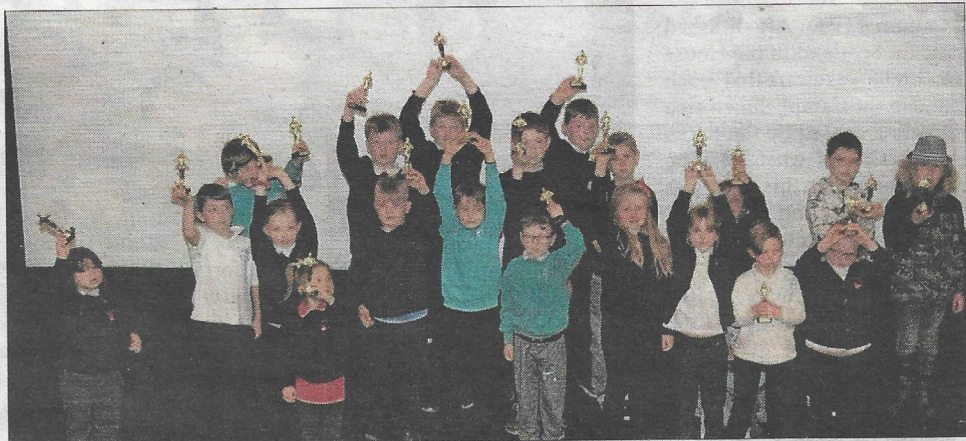
The children of Clachan, Rhunahaorine and Glenbarr primary schools with their awards after their animation showcase. 50_c14filmmakers01

After experimenting with the different stop-motion animation techniques, the children chose their favourites and