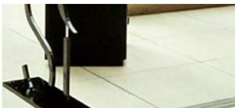
Per m2 – R130.00