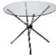
Glass Café Table R700.00