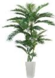
PARLOUR PALM - 60" R800.00