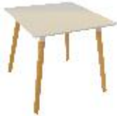
Constantia Bistro R750.00