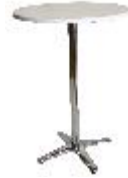
White Top Cocktail Table R600.00