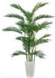
ARECA PALM - 48" R650.00