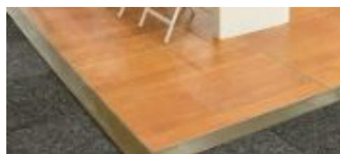
Per m2 – R130.00