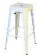
White Xavier R500.00