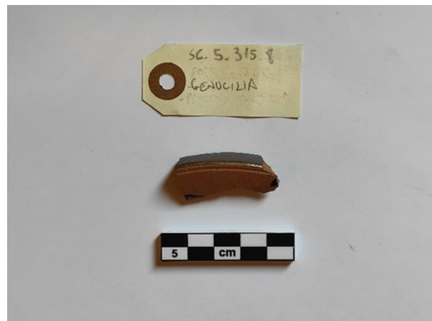
Fig. 10 On the tables a typical find box and a couple of diagnostic finds (cooking ware and genucilia). All finds were photographed when a drawing had been made.