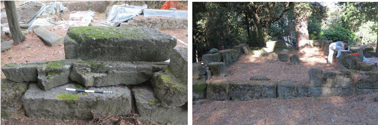
Fig. 6 Architectural element placed in the northern wall of room \delta and its documentation (2025).

In the northern wall of room \delta of the building made of large peperino ashlar, another architectural element has been reused, probably during the time when the Orsinis restructured the site (Figs 3 and 6). Originally, it may have formed part of the superstructure of a monumental building but was at some point recut and used as a threshold.