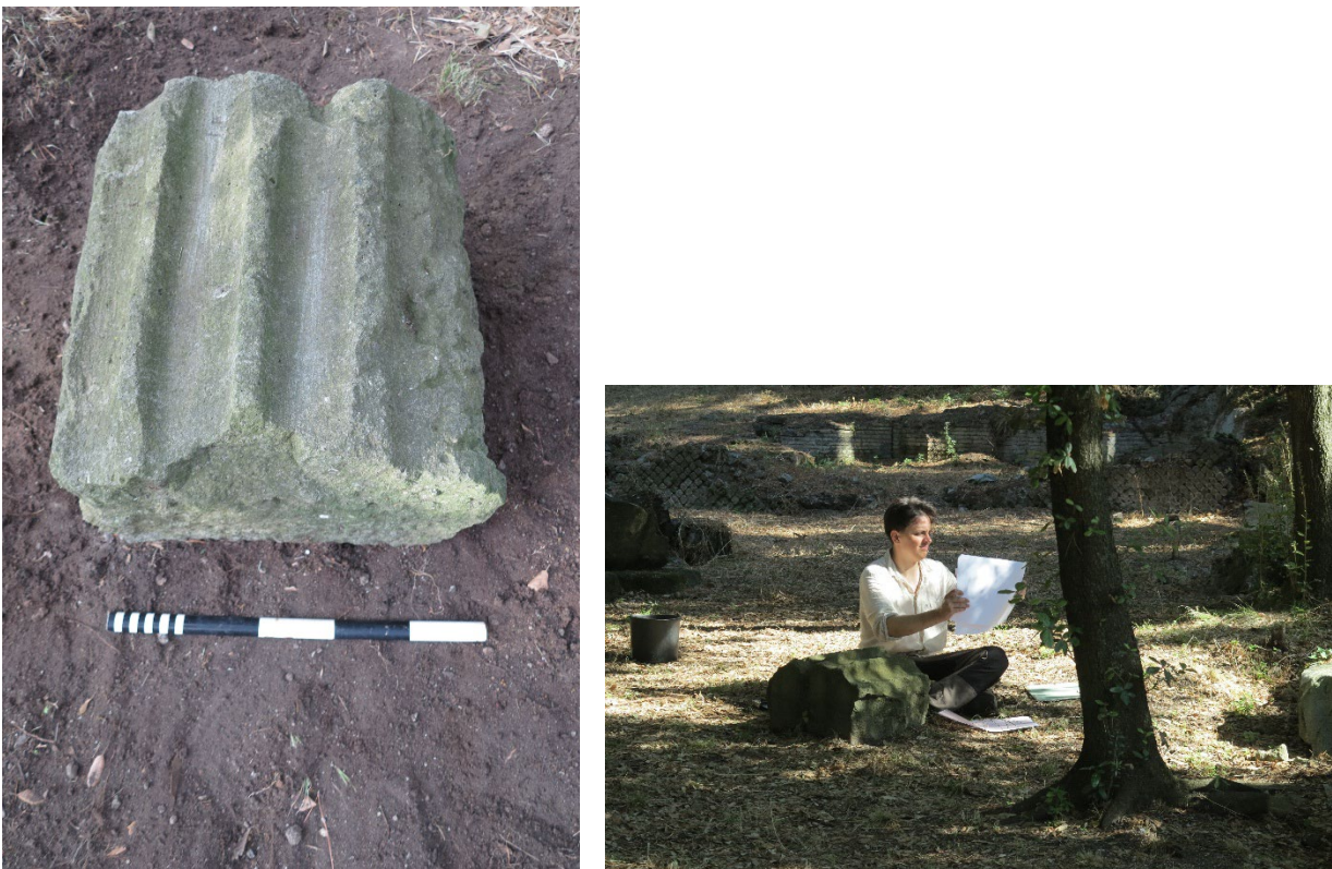
Fig. 5 Fragment of fluted column and its documentation (2025).