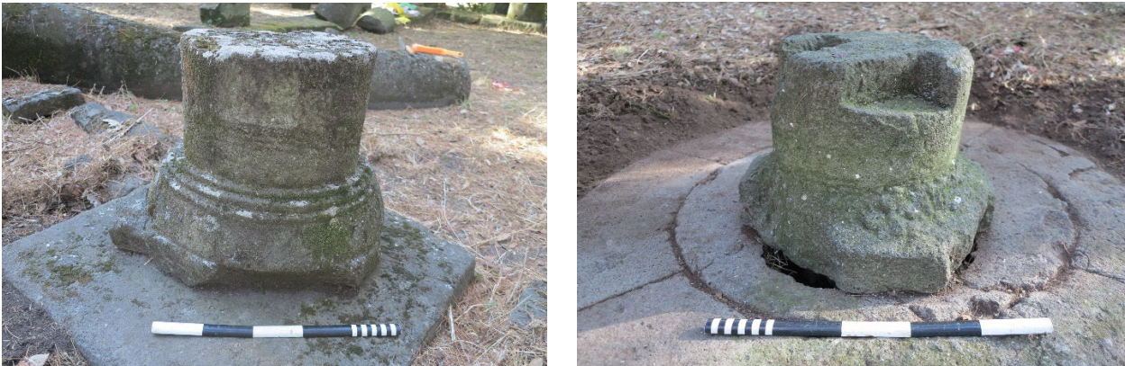
Fig. 4 Two Tuscan-Doric capitals, the larger is seen to the left (2025).

sizes presumably form the same period (Fig. 4). The upper diameter of the column is 43 and 37 cm respectively. Furthermore, there is one fragment of a larger fluted column that has been cut into a regular building block, measuring 53 x 30 cm (Fig. 5). Some of the reused and replaced blocks in the stylobate of the 'atrium' have the lower diameter of the columns indicated, and that corresponds to ca. 60 cm, (=2 RF). The reconstructed and recent columns in the 'atrium' show that the original height must have been around 9-10 m.