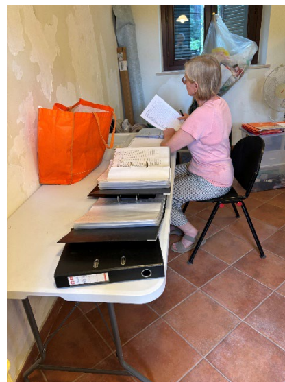
Fig. 9 Students working with the finds (2025).