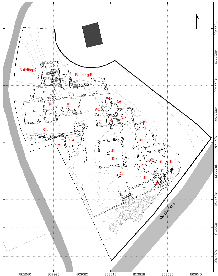
Fig. 3 Plan of the ancient remains on the site and with trenches indicated (---). (N. Bargfeldt & G. Luglio 2024/2025).