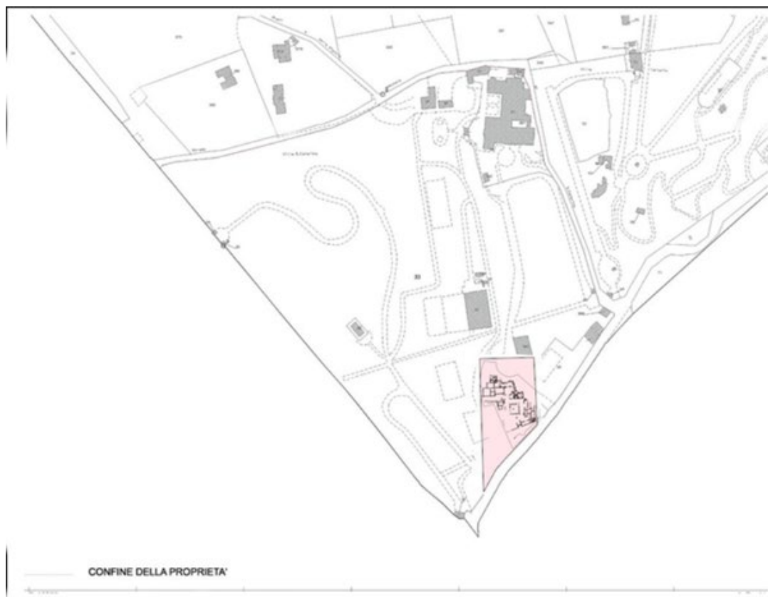
Fig. 2 Plan of Villa Santa Caterina with the ancient remains indicated in pink.