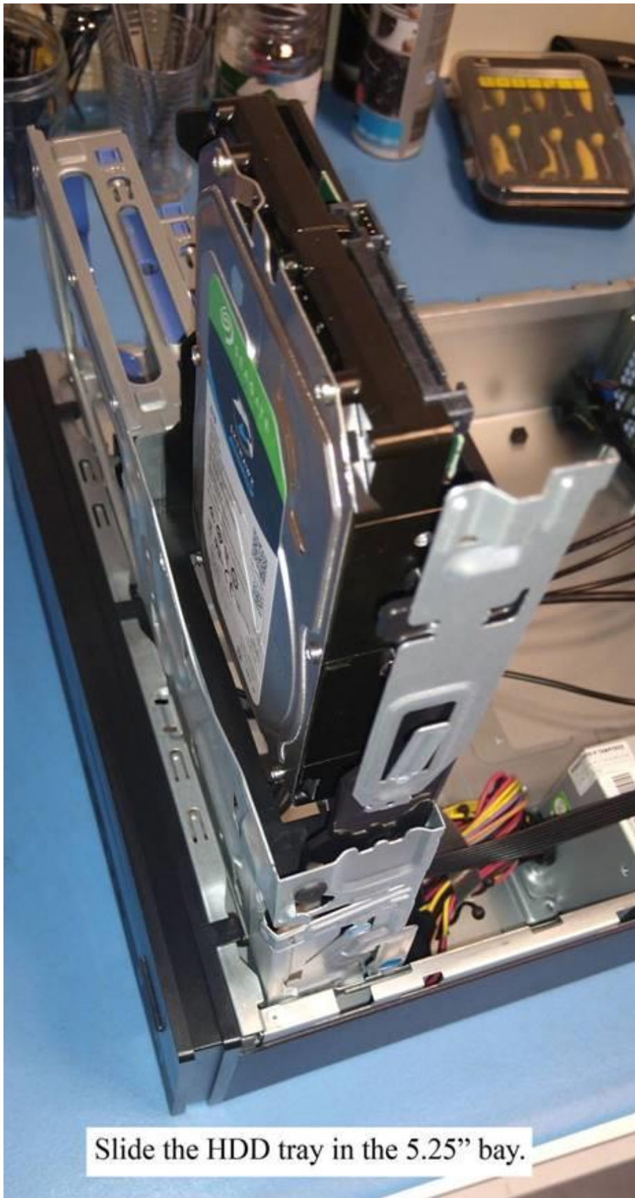
Slide the HDD tray in the 5.25" bay.