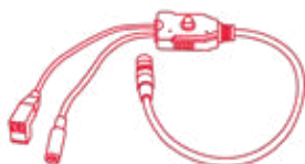
I/O Breakout Cable