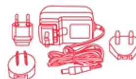
DC 12v Power Supply & Sockets Adapter