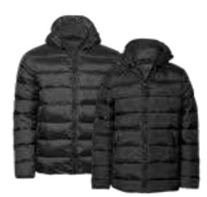
Lite Hooded Jacket | Style 9646 / 9647