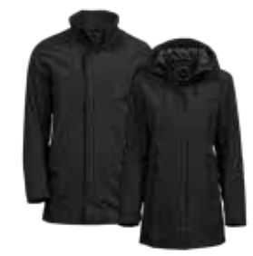
All Weather Parka | Style 9608 / 9609