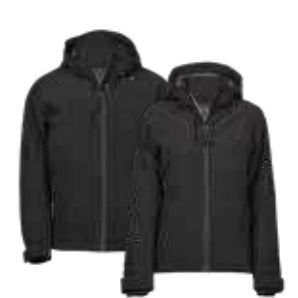
All Weather Winter Jacket | Style 9680 / 9681

To secure our premium standards we use high performance DuPont<sup>™</sup> padding in most of our jackets for a unique feel: Lightweight and smoother feel | Warm and breathable | Durability and insulation | Comfort stretch The DuPont<sup>™</sup> is a pattented technology; a performance insulation that provides you with excellent warmth, effordless softness and endless flexibility.