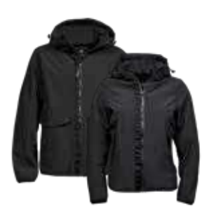
Urban Adventure Jacket | Style 9604 / 9605