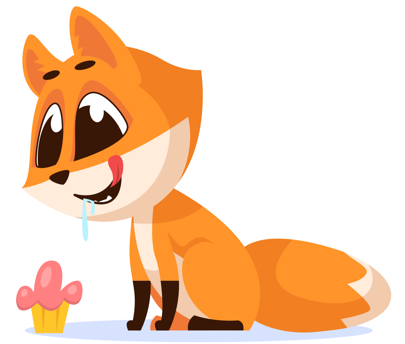
FAIM / SOIF HUNGRY / THURSTY