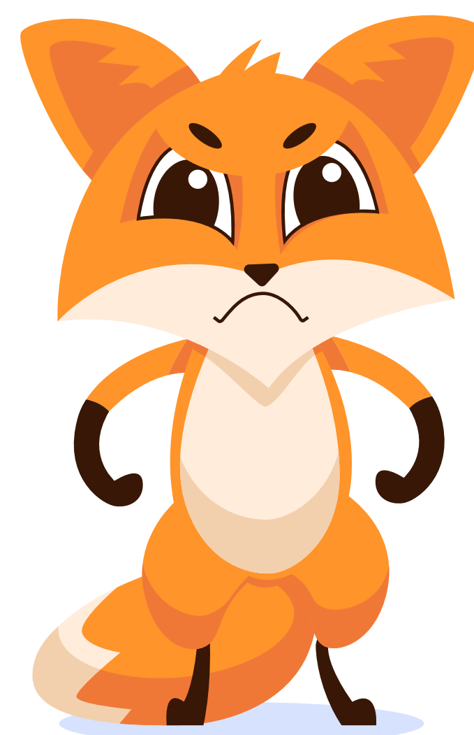
EN COLÈRE UPSET