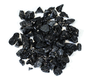
Black Glass Chip Ember Bed