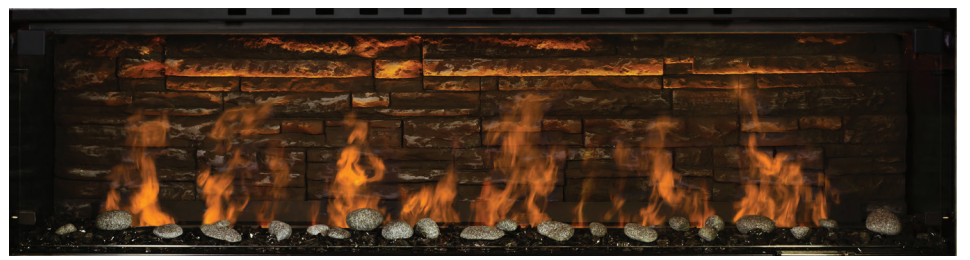
FFS-L60 with Optional River Stone Media and Ledgestone Back Brick