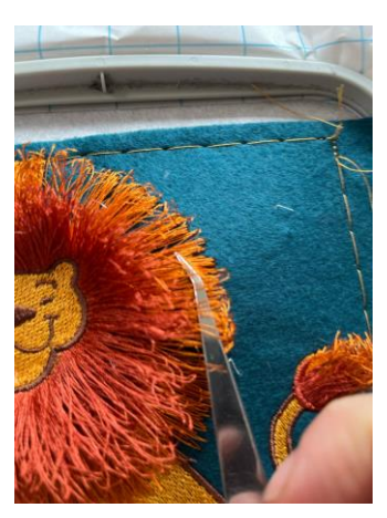
Step 8Pull the top upper thread of the second color from the fabric using tweezers.