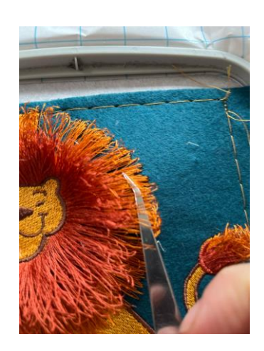
Step 9 Finished!