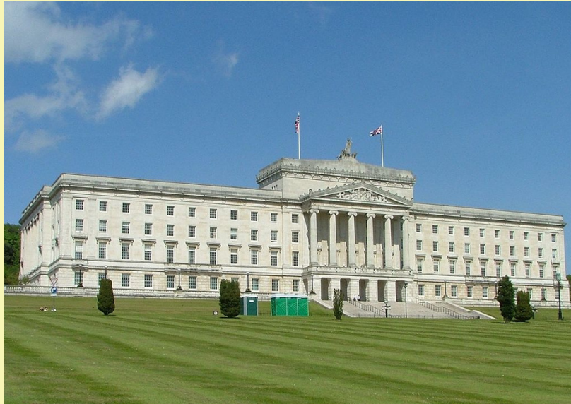
Photo of Stormont