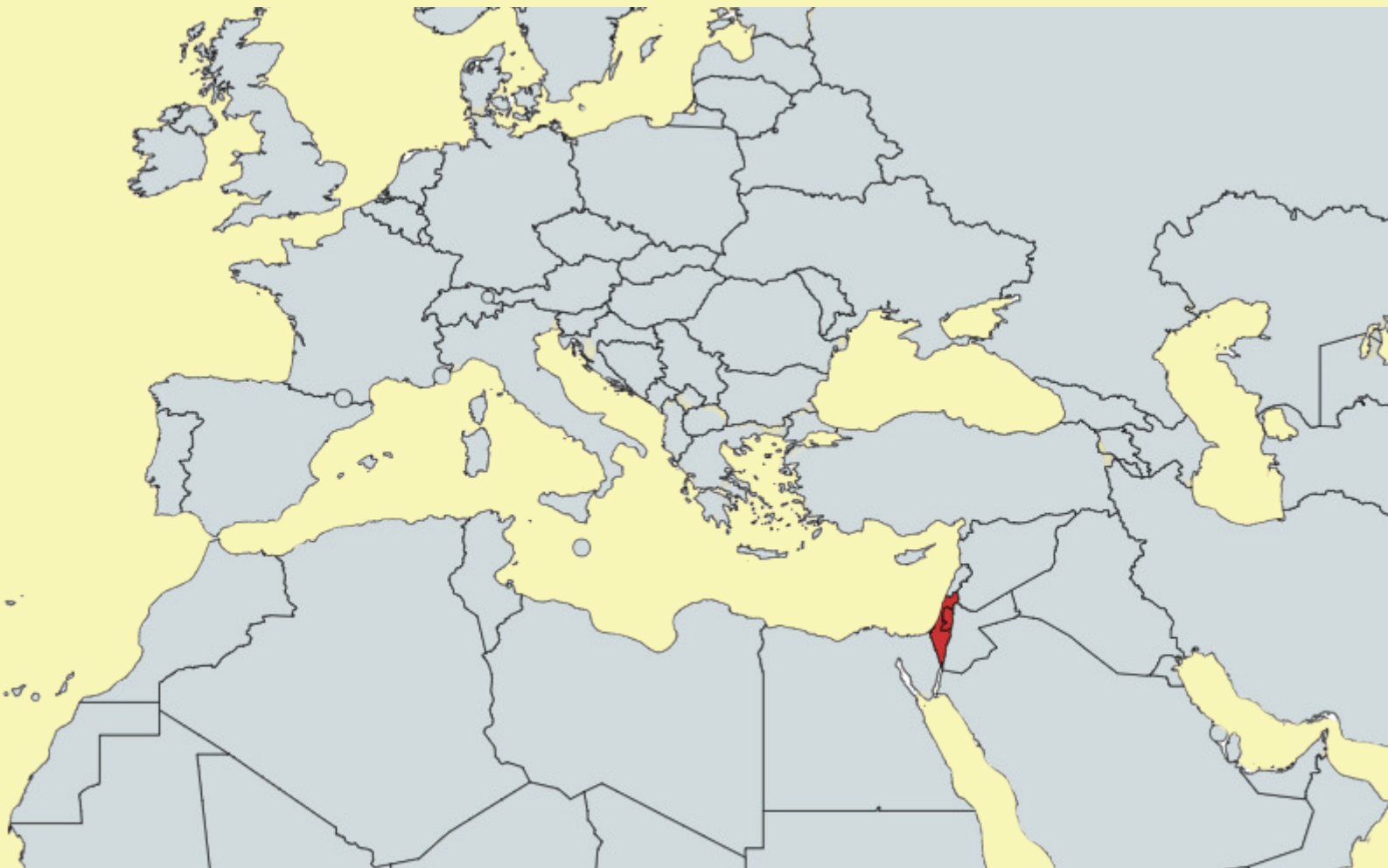
Map shows location of Israel and Palestine

The area in Palestine called Gaza is ruled by an organisation called Hamas. Hamas have been classified as a terrorist organisation. In October, Hamas launched an attack on Israel which was the start of the current conflict.