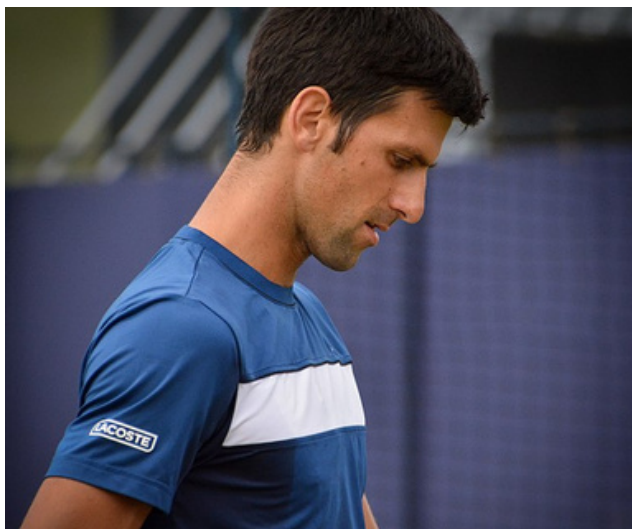
Photo shows Novak Djokovic.

In the women's singles, Polish tennis player Iga Swiatek defeated Czech tennis player, Karolina Muchova in a great match winning 2 sets to 1 to win her 2nd Roland Garros title in a row and her 3rd Roland Garros title in her career.