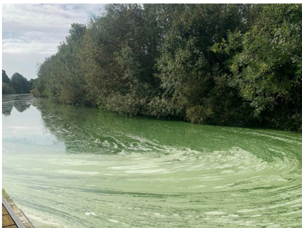
Photo of algae at Toome canal near Lough Neagh.

Many people across Northern Ireland are campaigning for something to be done to stop the algae. We will keep you updated on this story.