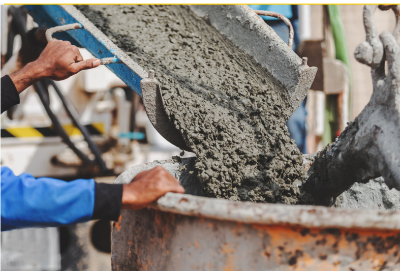
Photo is of concrete mixture being poured.

The reason there is a particular focus on schools is simply because the UK Government had already assessed how many schools were built using RAAC.