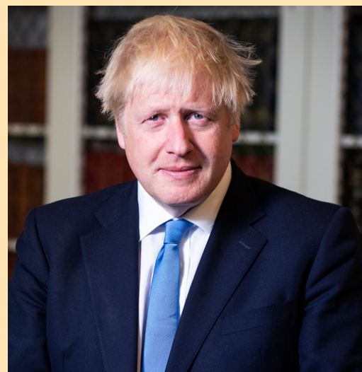
Former U.K. Prime Minister Boris Johnson