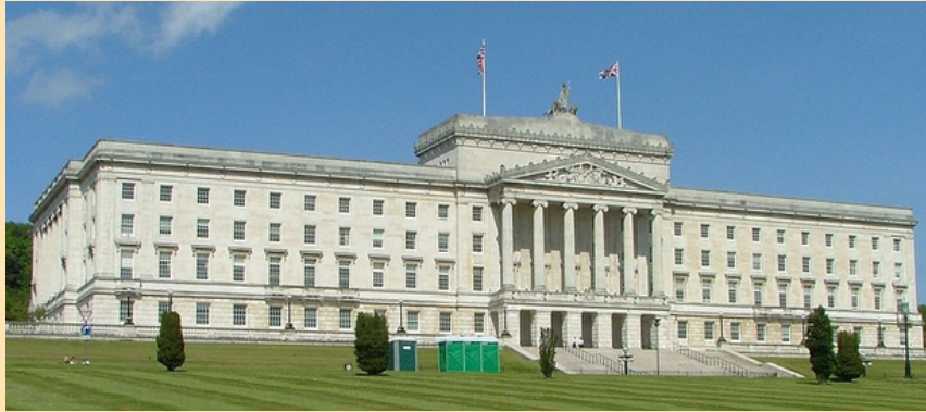
Photo: the Parliament Building at Stormont