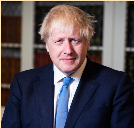
Photo: Former U.K. Prime Minister Boris Johnson