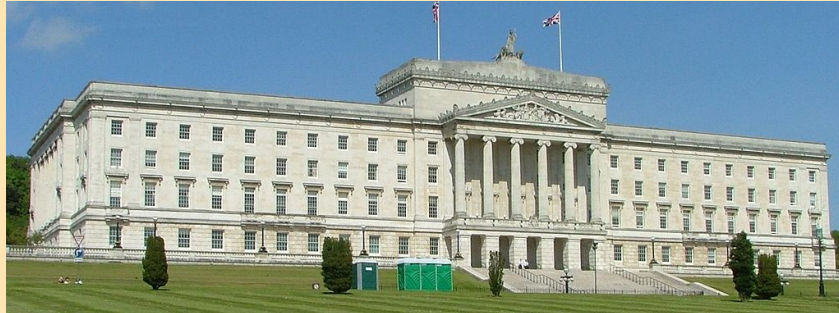
Photo: the Parliament Building at Stormont