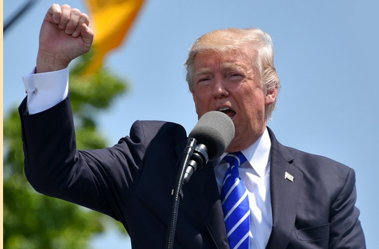
Former U.S. President, Donald Trump