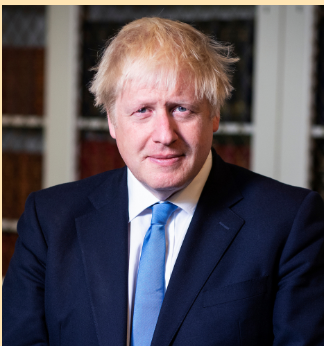
Photo: Former U.K. Prime Minister Boris Johnson