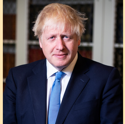
Former U.K. Prime Minister