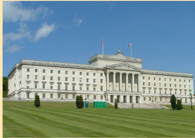
Image above shows a photograph of Stormont

The bill (called the Executive Formation Bill) will also give extra powers to the U.K. government politician who oversees Northern Ireland. If it become a law, they will be able to decide whether Northern Ireland has an election to vote in new politicians or give more time for the current Assembly politicians to get back to work in Stormont.