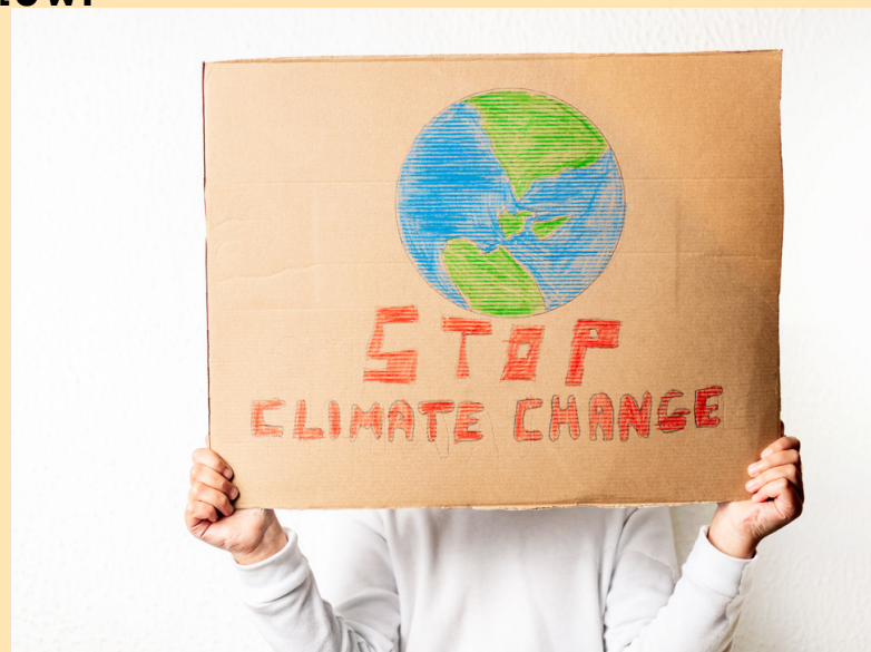
Image above shows a person holding a protest sign that says 'Stop climate change'

At this year's conference, countries agreed to create a fund to help people around the world most affected by climate change. This will help countries that experience extreme weather, like floods, droughts and rising seas.