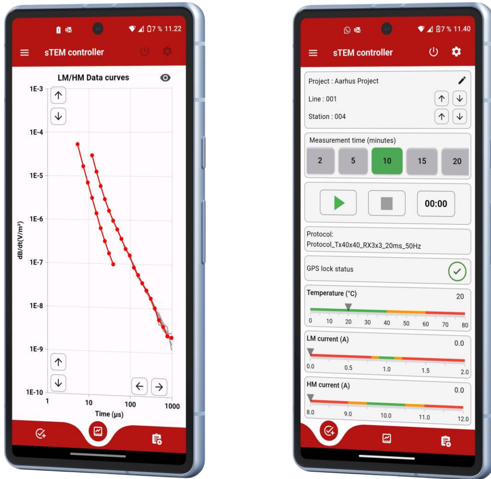
Figure 4 The picture shows the control app. The display to the left shows the measured decay curves, the display on the right show temperature, current and measurement time.