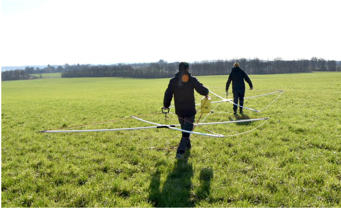
Figure 1: The sTEM profiler in operation. The system is operated from an Android or IOS app. The transmitter and receiver rigs are engineered to be very stiff.