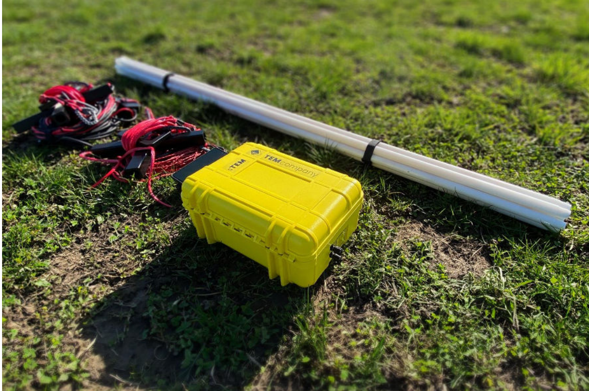
Figure 3: The picture shows the sTEM profiler system. The yellow box is the sTEM instrument, the white rods are used to build the rig and the black and red cables to the left is the receiver and transmitter coils.