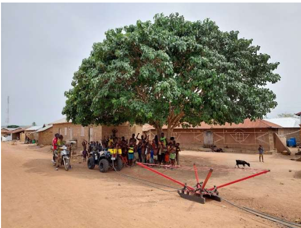
Figure 1. Survey in the host community Kpetchichoe

The tTEM instrument is a time-domain electromagnetic system designed for hydrogeophysical and environmental investigations. The tTEM system measures continuously while towed on the ground surface. It is designed for a very high near-surface resolution with very early time gates and a fast repetition frequency.