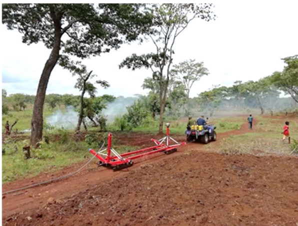
Figure 1. Fieldwork near the village Makere, Tanzania.

In October 2019, a tTEM mapping campaign was carried out in western Tanzania. The mapping campaign was conducted in cooperation between the HydroGeophysics Group, Aarhus University, Denmark, the Poul Due Jensen Foundation and Water Mission Tanzania. The aim of the mapping was to map the dominant hydrogeological units in the area, and to pick drill sites for wells. The tTEM instrument is a time-domain electromagnetic system designed for hydrogeophysical and environmental investigations. The tTEM system measures continuously while towed on the ground surface. It is designed for a very high near-surface resolution with very early time gates and a fast repetition frequency.