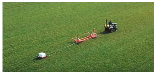
Figure 2. Photo of a tTEM survey in the Netherlands, 2023.

In the context of earth dikes in the Netherlands, the geology can be roughly subdivided into two groups; clays, which have a low resistivity, and sand with a high resistivity, so tTEM is especially well suited for delineating the two different soil types, although interpretation is more complicated when saline water is also present.