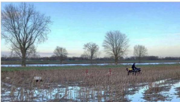
Figure 1. Photo from the survey, from a marshy flood plain.

An investigative tTEM survey was conducted in December 2021, carried out by The Geological Survey of the Netherlands – TNO, WSP and the Aa en Maas Waterboard, to assess the tTEMs usability in this case.