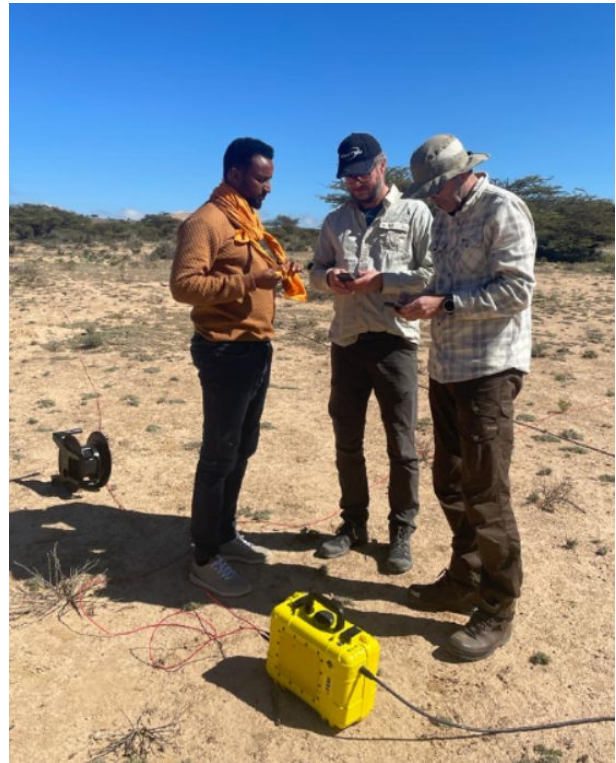
Figure 1 The field crew collecting the TEM soundings