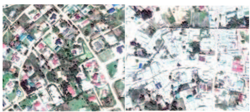
Figure 2: (left) Kamukuzi residential area (right) Kisenyi residential area in Mbarara

in developments is visible is Arua Municipality (Figure 3) in which Arua Hill, a predominantly leasehold residential area is visibly better spatially organized than River Oli, a settlement for the urban poor, where the land is predominantly held customarily.