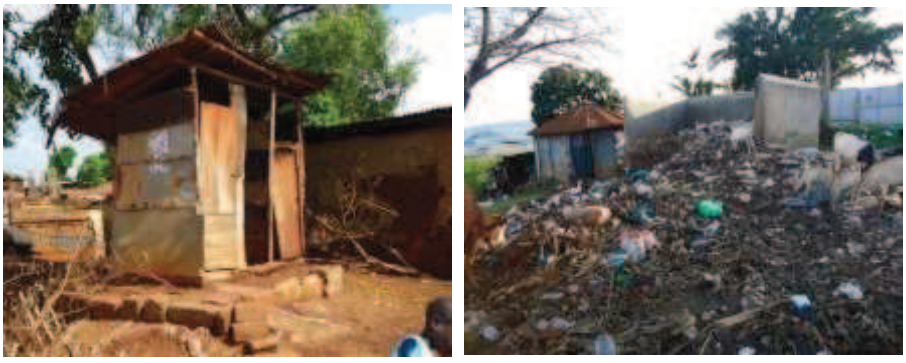
Figure 6: Poor Sanitation facilities in urban poor settlements