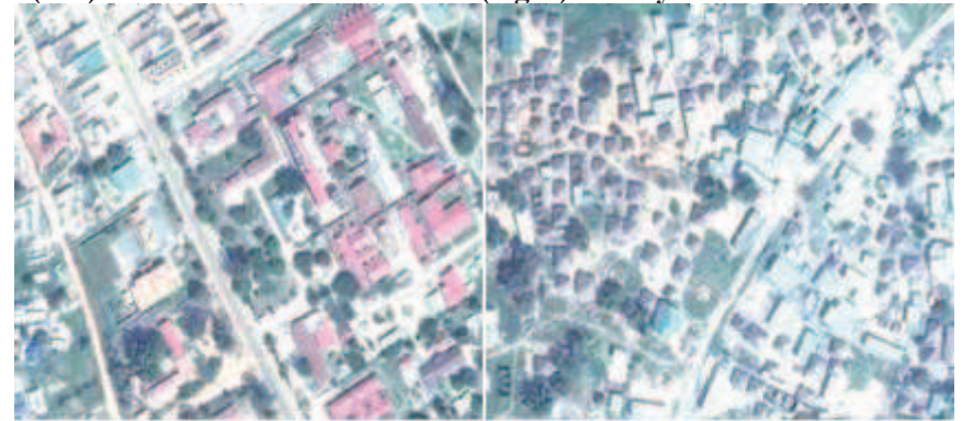
Figure 3: (Left) Arua Hill-titled (Right) River Oli – Customary