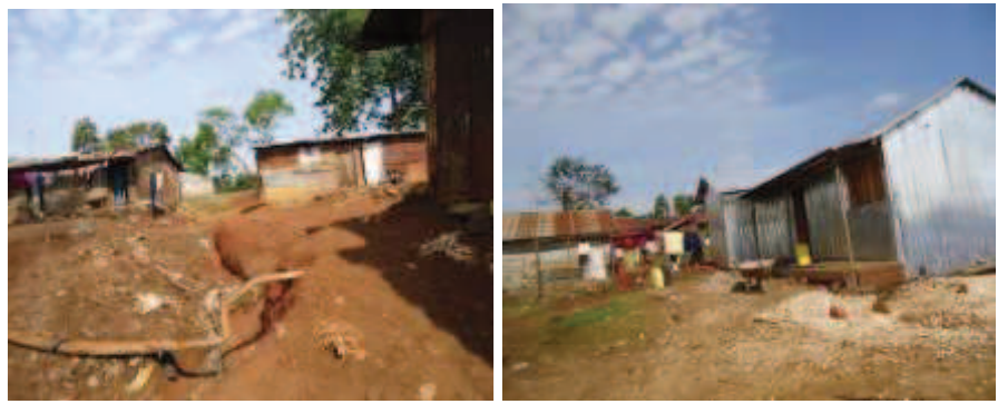
Figure 5: Examples of Houses in informal settlements