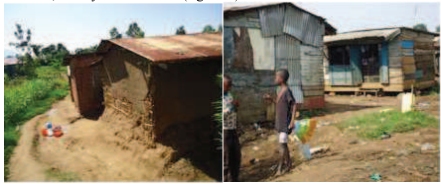
Figure 4: Examples of housing structures in informal settlements

In the two municipalities, the study revealed distinct disparities between informal settlements and other better organized settlements based on the nature of housing structures and services. Houses in informal settlements were very small (one roomed), constructed from inferior materials such as mud/wattle and grass (Figure 4), well as the housing structures in other settlements were larger (one, two or three bedrooms) and constructed with more expensive materials such as burnt bricks, iron sheets and tiles. Access roads in informal settlements were very narrow, dusty and did not serve all the houses. A number of houses did not have access roads reaching them and one would have to wind through footpath, house verandas in order to reach some of the housing units. Other basic infrastructure, such as water and sanitation, electricity and community facilities were found to be sorely deficient, if they existed at all (figure 6).