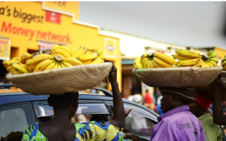
Banana sellers in Western Uganda

certification standards into the local languages and simplified them as much as we could. But the organic and the fairtrade certification requirements are not very relevant to African culture. It was difficult for the farmers to understand. For example, they were told to use formal documentation and to keep records of the growing process of their crops for the certifier. But farmers are not office people. They are not used to record keeping.” Luckily, Muwanga said that overall, they did notice the farmers’ willingness and the understanding of becoming certified, whether it was organic or fairtrade. “Climate change is very noticeable in Uganda, especially in the dry north,” Muwanga adds. The farmers were grateful to learn how to conserve water as they realised that it makes them perform better and produce a better harvest. “