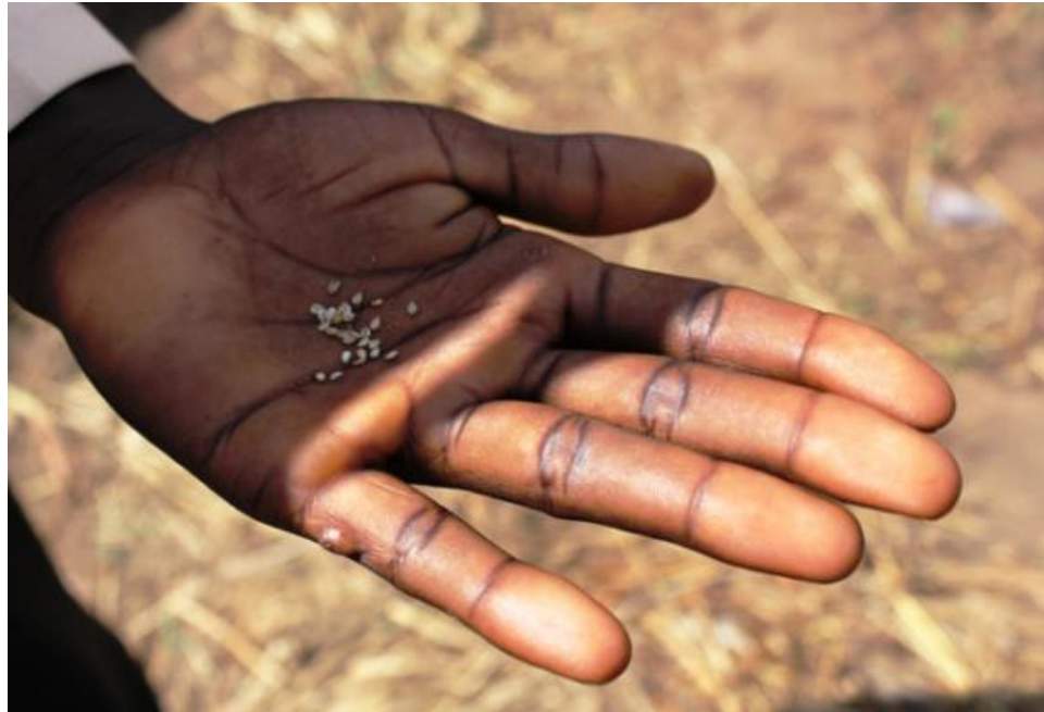
Above: Sesame seeds or 'simsim' Previous page: farmer in front of her grain storage in Abim, northern Uganda

For this reason the Trade for Development Centre partnered with NOGAMU, the National Organic Agricultural Movement of Uganda, to ensure that farmers are able to sell their entire harvest at a fair price and grow their businesses sustainably.