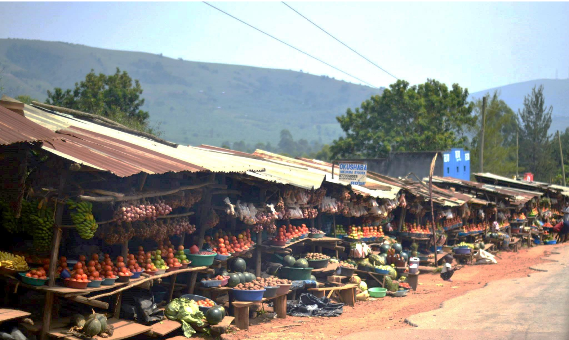
Road market in Western Uganda