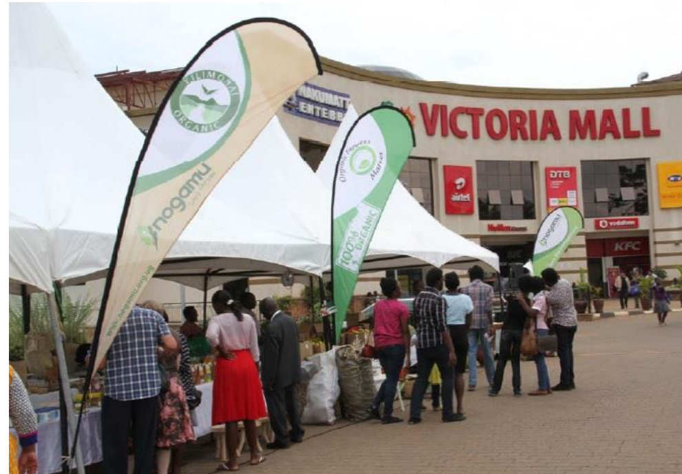
Farmers promoting organic products at the entrance of Victoria Mall in Kampala, Uganda

The results do not lie: over 8,700 farmers joined a cooperative and 100 internal inspectors were trained in European, Asian and American Organic Farming regulations. The target of 30% female leaders of cooperatives was also set. As many of the cooperatives mainly comprise women (sesame growers are all women), 70% of the leaders are female! And finally, 3 large cooperatives were trained in implementing organic and fair trade quality management systems and were linked to one local trading company and 3 exporting companies.