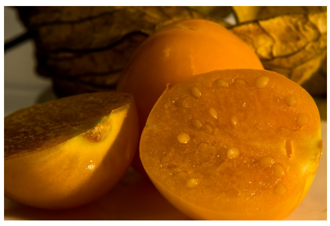
Physalis is full of vitamins and antioxidants

The European market is by far the most important. Not until the summer of 2014 did the United States drop the cold chain imports condition for physalis which was considered necessary to keep out fruit fly larvae. This decision considerably reduced costs for exporting uchuva and the Colombians hope to sell even more of their "next big super fruit to hit the market" as fruit exporter Robinson Martinez calls it.