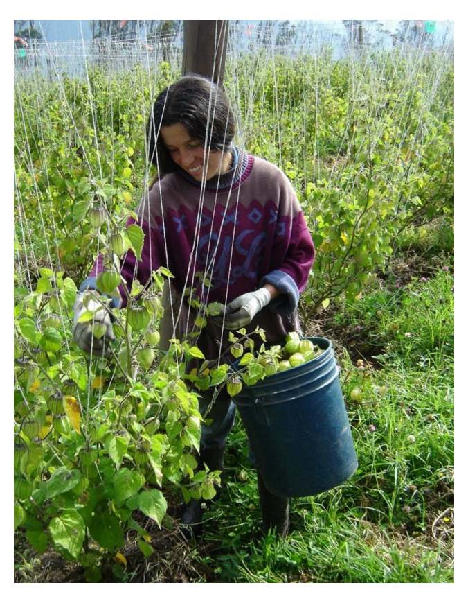
Physalis harvesting in Colombia

In 2010 physalis was included in the Fairtrade International (FI) register and the fair trade premium for both dried and fresh and for organic and conventional physalis was set at 0.10 dollar cents per kilo. Meanwhile five producers' groups have been certified – four in Colombia and one in Uganda – as well as eleven traders – three in Colombia and eight in Europe. Fair for Life also certified one Colombian and two European traders.