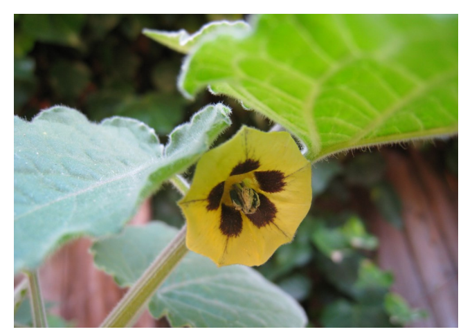
Lantern plant flower

The uchuva – as Colombians call the Inca berry – appeared on the world market in the early 1990s. A few large Colombian fruit exporters tried to create 'plantations' to meet growing international demand but they underestimated the know-how and experience needed for this crop.