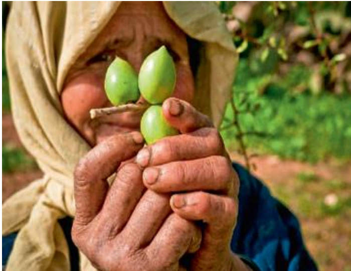
Les fruits de l'arganier