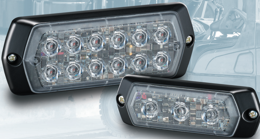
Luminous Color Type