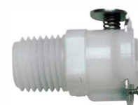
Typical shown: 1/4" NPT Male Pipe Thread with Shut-off Valve

These adapters are available with or without an integral shut-off valve. The shut-off valve will stop line flow when the adapter is removed from the unit. Flow resumes when connected.