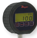
DPG-100 with protective rubber boot