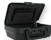
Protective carrying case