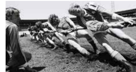
WC Outdoor 1976 Cape Town - bronze 640 kg Switzerland