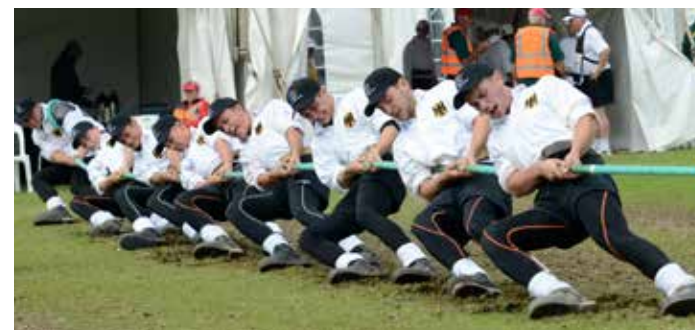
WC 2018 Cape Town - Germany