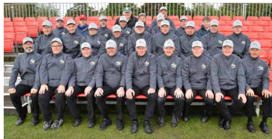
EC 2017 England Judges