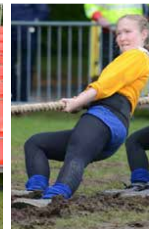
EC 2019 Lady Sweden, Castlebar