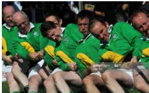
World Games 2009 Kaohsiung - Irish team