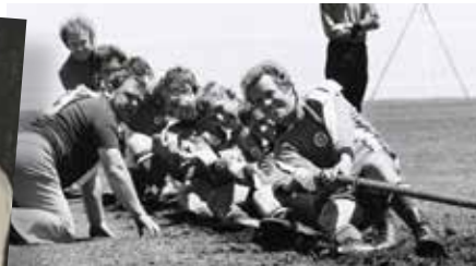
WC 1976 South Africa - Germany 5th place in 640 kg