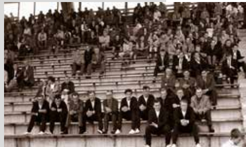
EC 1965 London