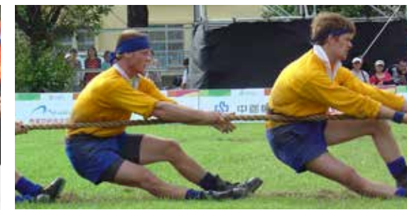
World Games 2009 Kaohsiung, Sweden