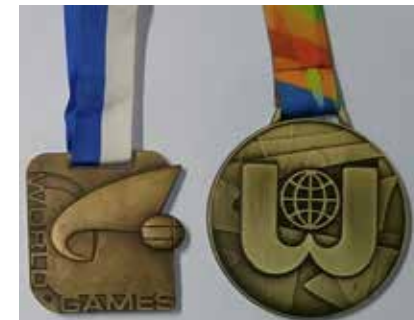
Medals World Games