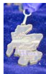
Far left, WC Indoor 1991 Getxo, Basque Country Left, 2012 Perth Scotland Medal Right, WC Indoor 1991 Getxo 1991, Basque Country Far right, WC Indoor 2020 Letterkenny Ladies Germany