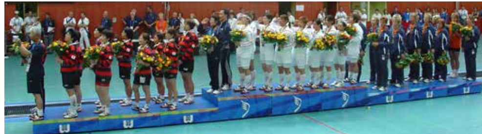
World Games 2005 Duisberg