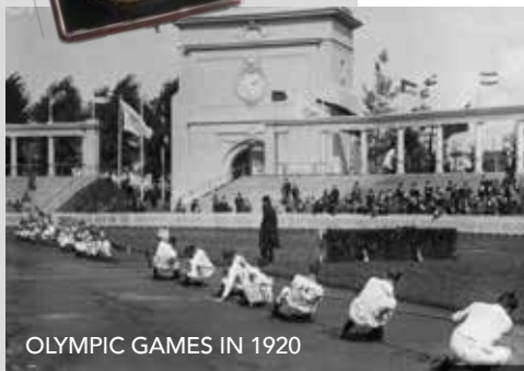
OLYMPIC GAMES IN 1920