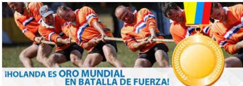
World Games 2013 Cali Colombia Gold Netherlands 680 kg