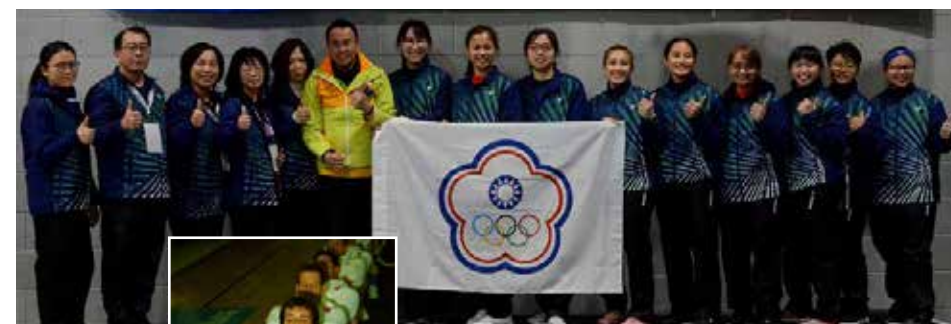
Right WC Indoor 2020 Letterkenny Ladies Chinese Taipei