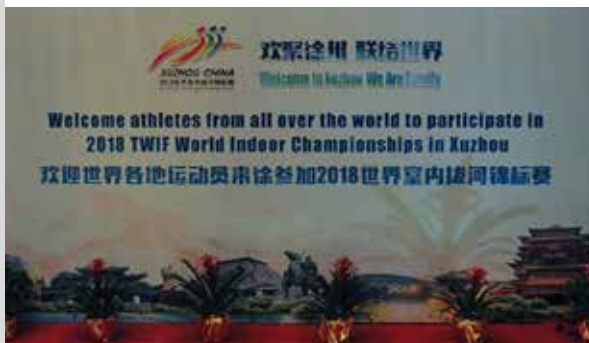
WC Indoor 2018 Xuzhou China