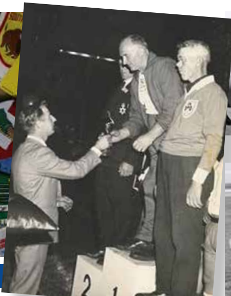
WC 1968 Netherlands