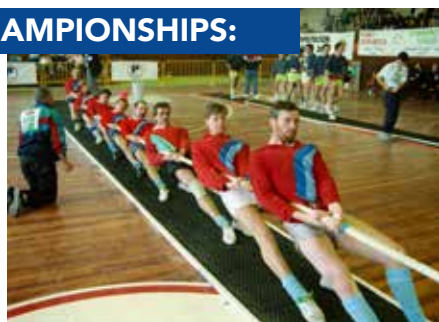
WC Indoor 1991 Getxo, Basque Country