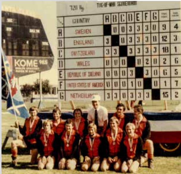
1981 World Games Santa Clara