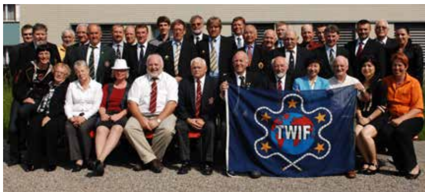
Group photo of the Congress in 2011

I consider myself extremely fortunate. Finally, I wish to extend my best wishes to all the TWIF family with the hope that the years ahead will bring further expansion and the return of our beloved sport to its rightful place on the Olympic Programme.