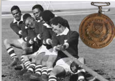
WC 1976 South Africa - Republic of Transkei