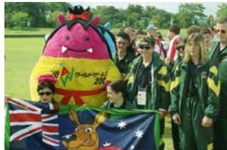
World Games 2001 Akita - Ladies Australia