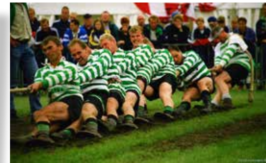
EC 1999 Koapmanboys during Slagharen, Netherlands