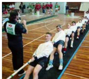
WC Indoor 1991 Getxo 1991, Basque Country