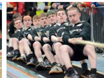
WC Indoor 2020 Letterkenny Ireland Youth