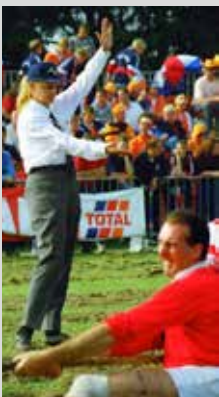
EC 1997 Jersey Judge