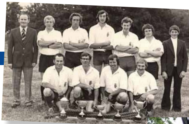
EC 1971 Garvagh represented Northern Ireland in Gothenburg, Sweden - 640 kg took Silver