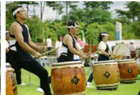
World Games 2001 Akita