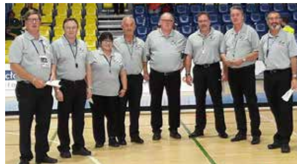
World Games 2017 Wroclaw, Judges