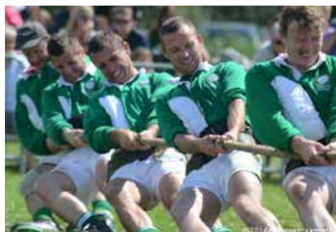
WC 2014 Madison, Ireland