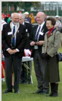
EC 2007 Minehead