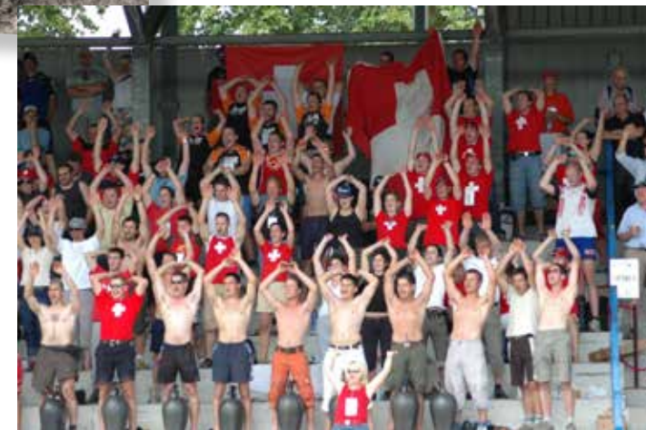
Left, EC 1999 Latvia | Above, EC 2005 Cento, Italy