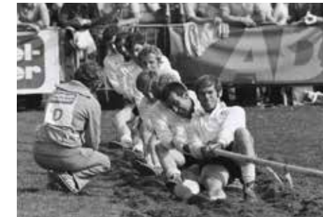
WC 1980 Basel - England World Champion 640 kg