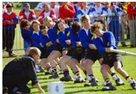
WC 2000 Blackpool - Ladies Belgium