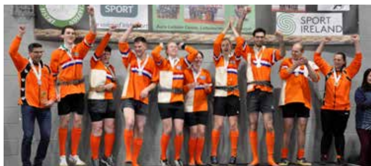
WC Indoor 2020 Letterkenny - Dutch Team