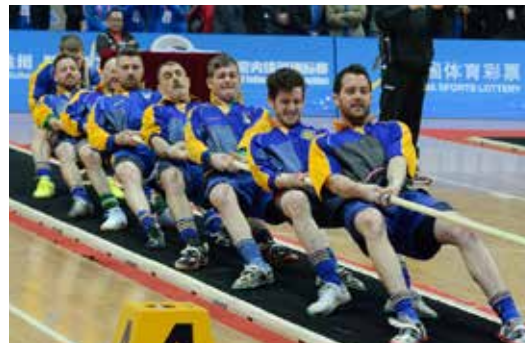
WC Indoor 2018 China, St. Pat's