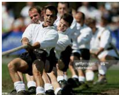
World Games 2005 Duisberg - Germany Team