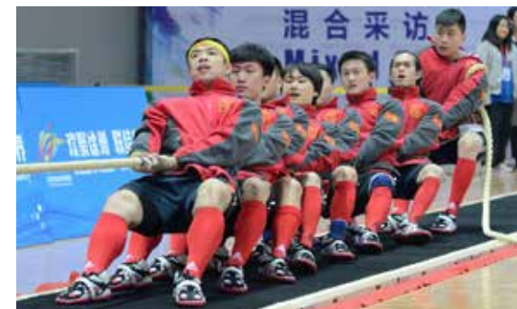
WC Indoor 2018 China