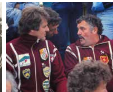
WC 1986 Slagharen Netherlands