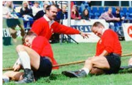
World Games 1993 The Hague, Switzerland