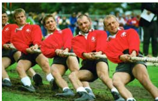
WC 2000 Blackpool, Switzerland