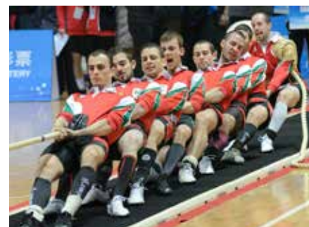
WC Indoor 2018 Xuzhou China Basque Team