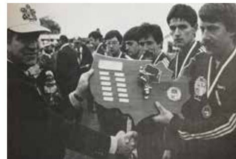
WC 1984 Oshkosh Nuarbe, Basque Country - Gold 560 kg