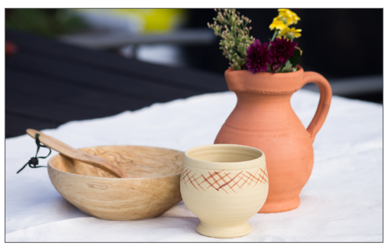
These are some handmade items I use for medieval reenactment, but I actually like using them in my evveryday life too.

Task: Select an item in your home that you can give new life or see if someone is throwing out something that you could use with small updates.