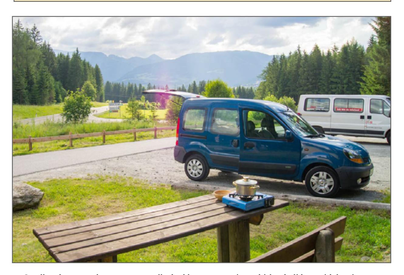
Small and compact but my car actually doubles as a camping vehicle = holidays with less impact.

Task: Write down a day of the week when you can go grocery shopping before or after work.