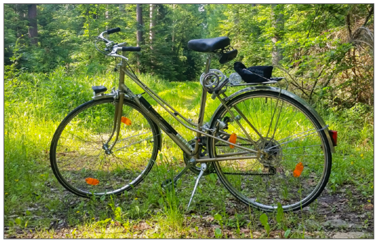
I use a bike from 1979. Works perfect and takes me where I want to go.

9. Go for local vacations. What do you really need during your vacations? My guess is that you need some time off and that it doesn't have to be some exotic resort every time. Check up what your local area or nearby countries have to offer. There are probably loads of things to see and experience. You don't need to go half across the world every time you go on holidays.