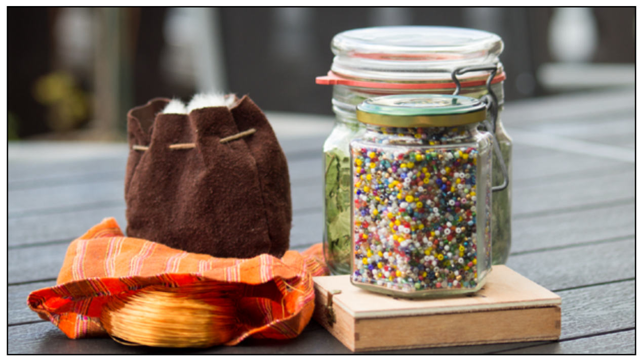
Some nice alternatives to plastic storage boxes.

4. Only wash when you have enough dirty clothes to run the washing machine full, that saves both water, power and detergent.