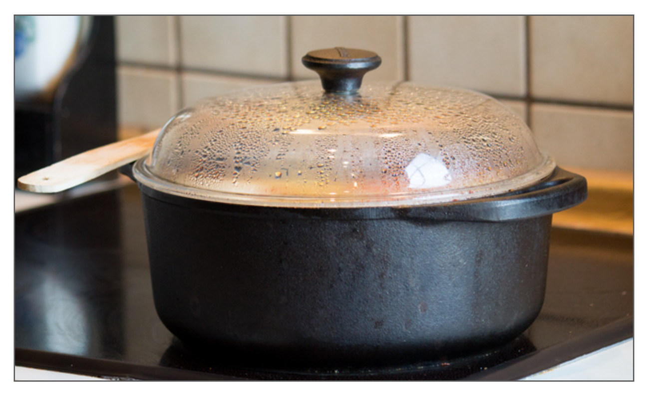
An iron pot like this will last you a lifetime if you take good care of it.

6. Buy a Fairphone (or other phone based on the Phonebloks idea) next time you need to switch. These are produced with conflict-free minerals, better conditions for the workers and have replacable parts. Who hasn't dropped their phone on the floor and seen the screen crack? With these phones you can repair it yourself + you can upgrade them bit by bit when needed instead of replacing the whole thing. Apply the same kind of thinking for other IT products and select TCO certified electronics when available.