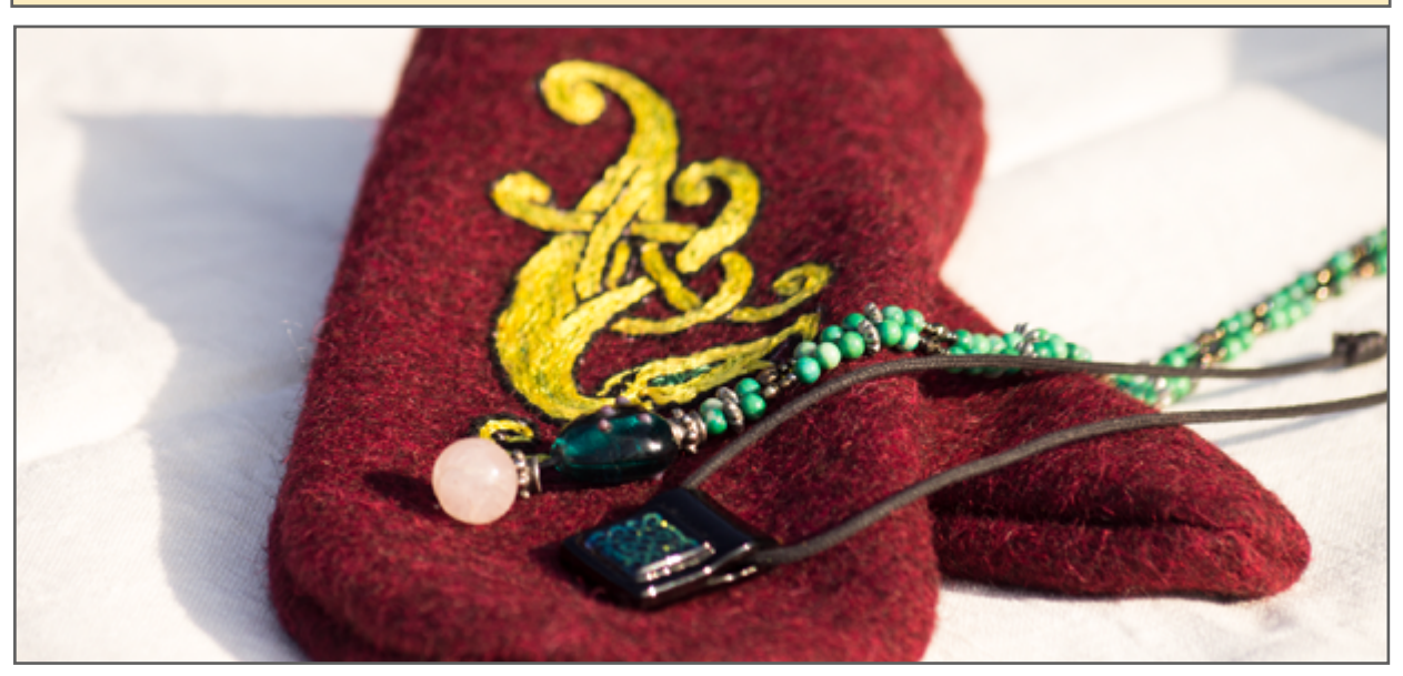
Handmade jewelry and mittens.

Task: Write down a couple of things from your personal wishlist/need to buy list and see if someone in your local area offers them.