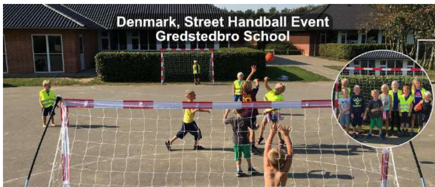
Denmark, Street Handball Event Gredstedbro School

Do you have ideas or wish to cooperate please let us know. Do not hesitate to contact us.