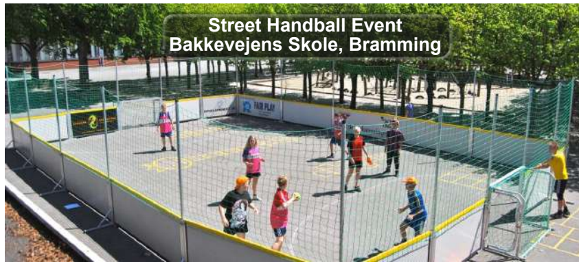
Street Handball Event Bakkevejens Skole, Bramming

Street Handball from your playtime / schoolyard / multi pitch / outdoor / indoor field. Please let us know when you host an event in your sports lesson or for the school's sports day, etc.