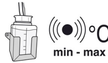
Ballasted sensor for simulation of product temperature alarm