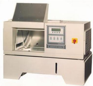
Solarbox 1500e with flooding