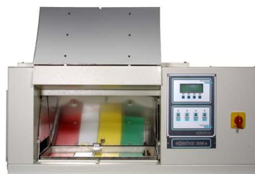
Solarbox 3000e: table top xenon testers 4 models