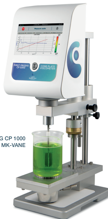
FIRST PRODIG CP 1000 + MK-VANE