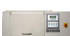
Solarbox 3000 e