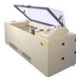
Corrosionbox H 1000 I