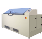
Corrosionbox H 600 I