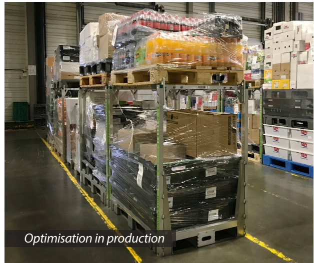
Optimisation in production

Loading is similarly efficient with two pallets being loaded at a time.