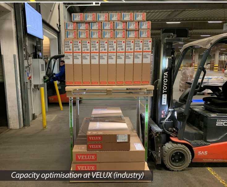
Capacity optimisation at VELUX (industry)