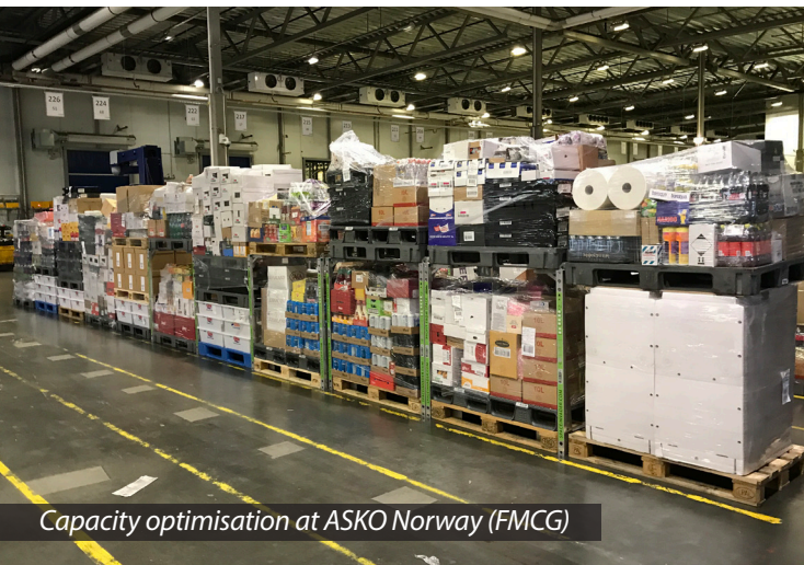
Capacity optimisation at ASKO Norway (FMCG)