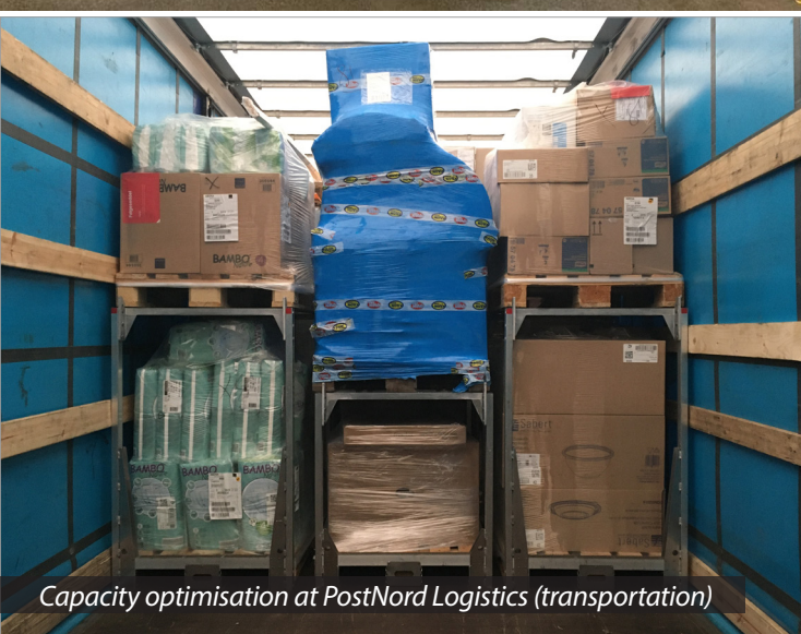
Capacity optimisation at PostNord Logistics (transportation)