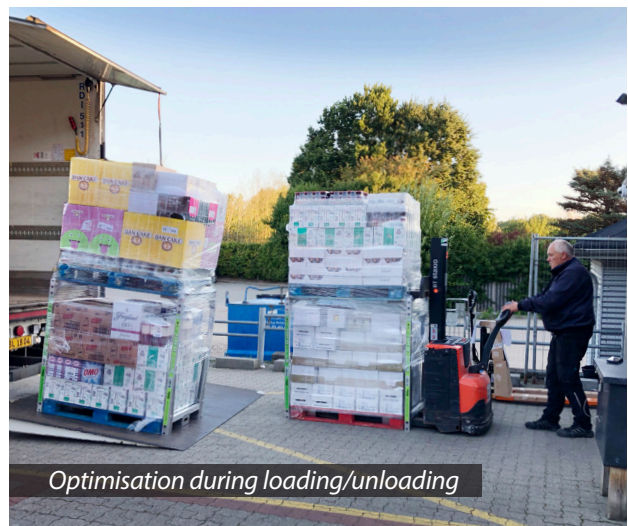
Optimisation during loading/unloading