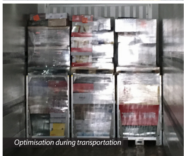
Optimisation during transportation