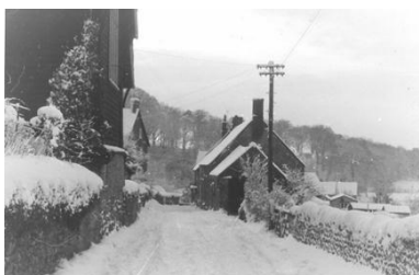
Chedington - Jan 1963