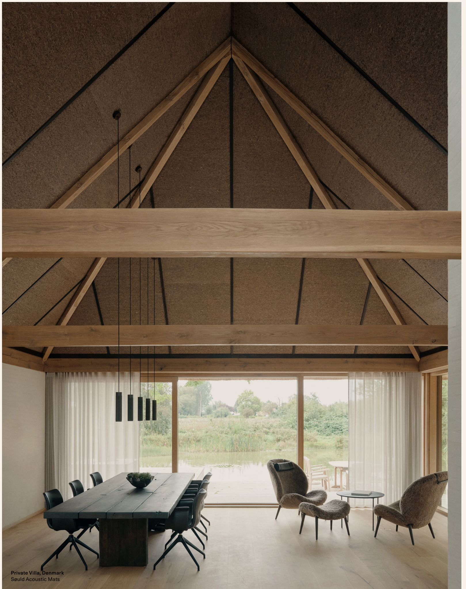
Private Villa, Denmark Søuld Acoustic Mats