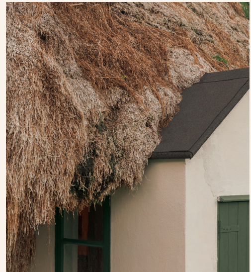
1. Built in the 17th Century, traditional seaweed houses on the Danish island of Læsø represent the first use of eelgrass as a building material.

After a decade of research and development into the material, Søuld has emerged as an expert in eelgrass and is the first company to convert the material into carbon-storing building materials that combine high acoustic performance, safety and health with modern aesthetics. Working together with local farmers, municipalities and ecologists, Søuld has optimized eelgrass collection based on environmental protection and the preservation of natural eelgrass meadows.