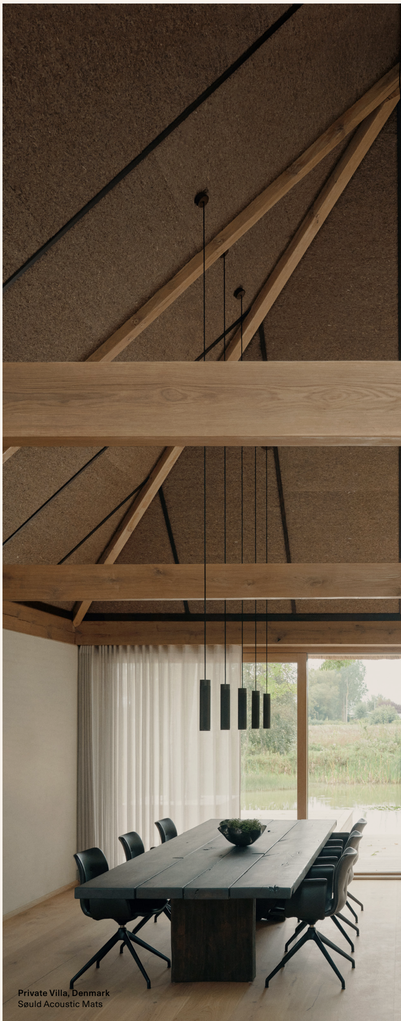
Private Villa, Denmark Sould Acoustic Mats