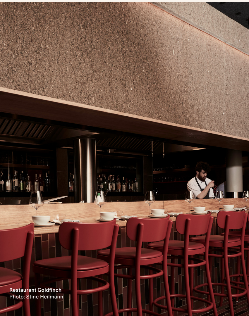
Restaurant Goldfinch