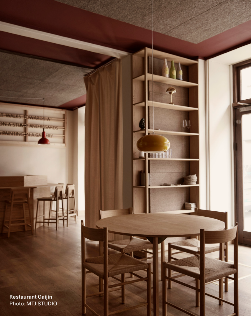
Restaurant Gaijin