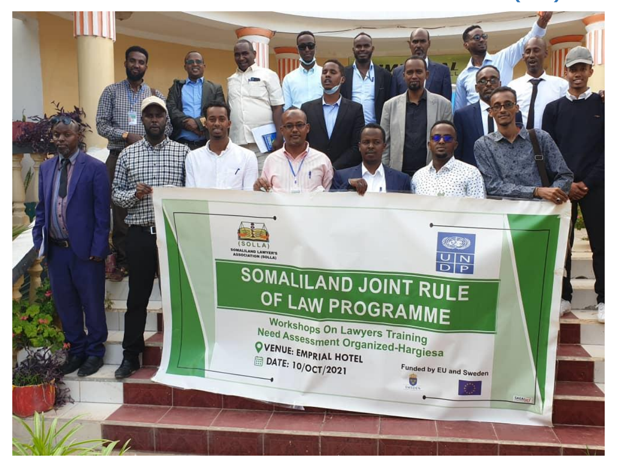
Photo group of Hargiesa's TNA Workshop which was held at imperial hotel on 10 Oct, 2021

Workshop titled Workshop on lawyers training need assessment was being implemented by SOLLA. It was funded by UNDP. The overall objective of the Workshop was to provide training need assessment and continuous professional trainings for lawyers to enhance lawyer competence, strives for excellence in the delivery of legal services and to be accountable to the public for the ongoing professional development and competence of lawyers. Specifically, this workshop aims to support, promote and improve legal professional management in three main cities i.e. Hargeisa, Burao and Borame. This is to be achieved through the reform/introduce of Professional enhancement to reduce the impact of malpractice and professional negligence through increased awareness and relevant capacity building programs.