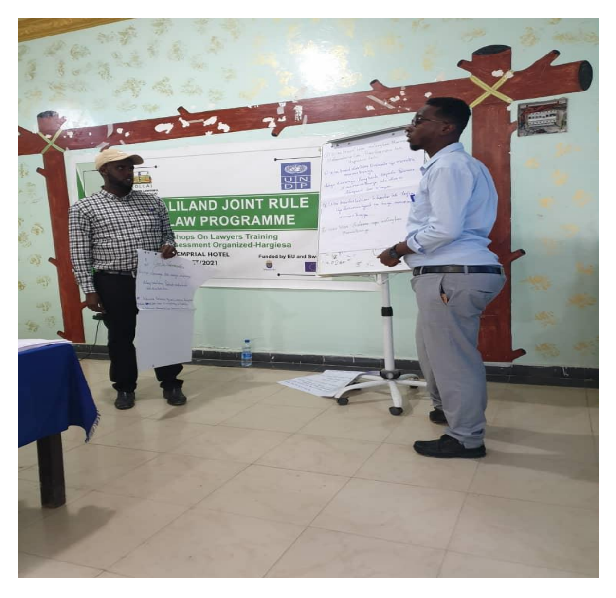
Photos of Group presentation during Hargeisa TNA Workshop at Imperial hotel on 10 oct,2021