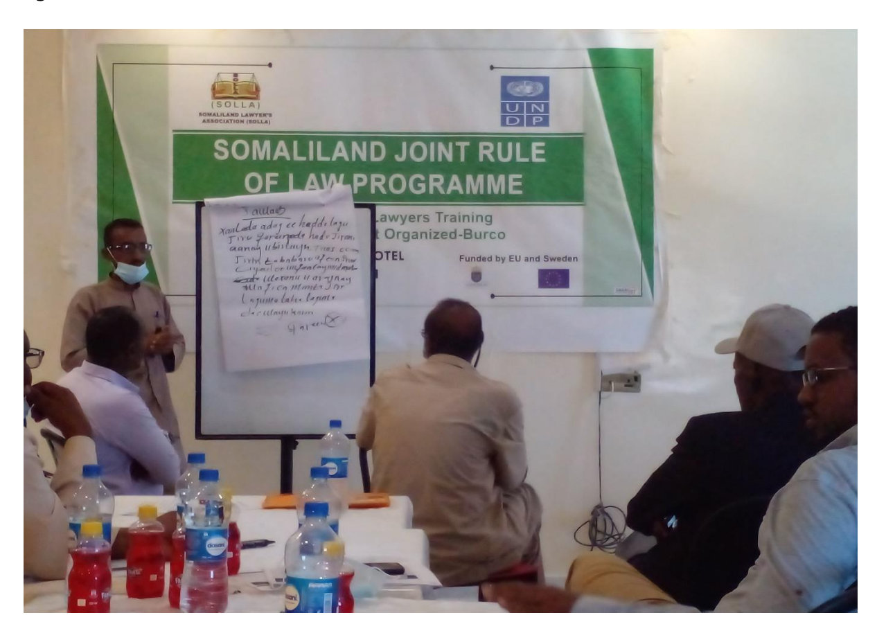
Photo of Group presentation during Burao TNA which was held at Liban Hotel on 27 oct, 2021

In the future all of those areas need to be placed under the emphasis. Provision of trainings which are designed to achieve to cover such needs are collectively proposed by the participants.