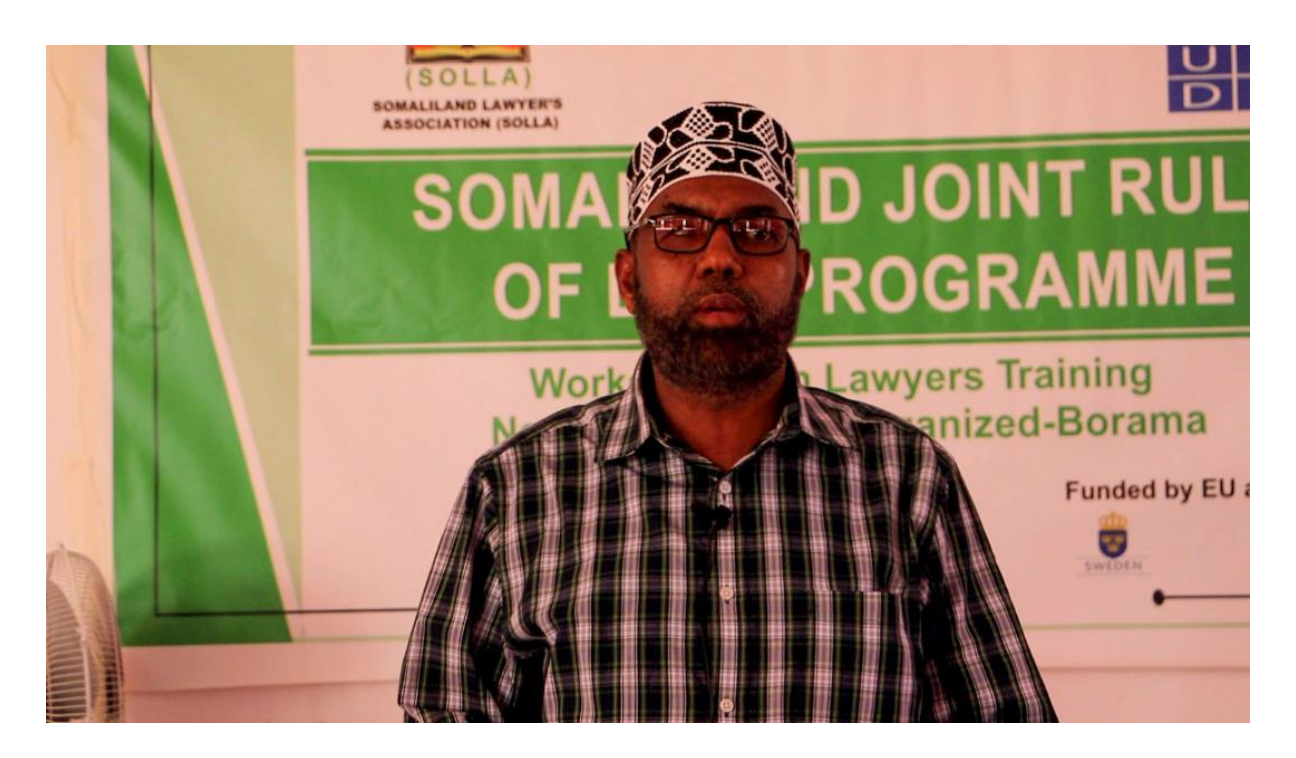
Photo of Borama regional President of high court of Appeal, who took part the opening ceremony of Borama TNA on 20 Oct, at rays hotel