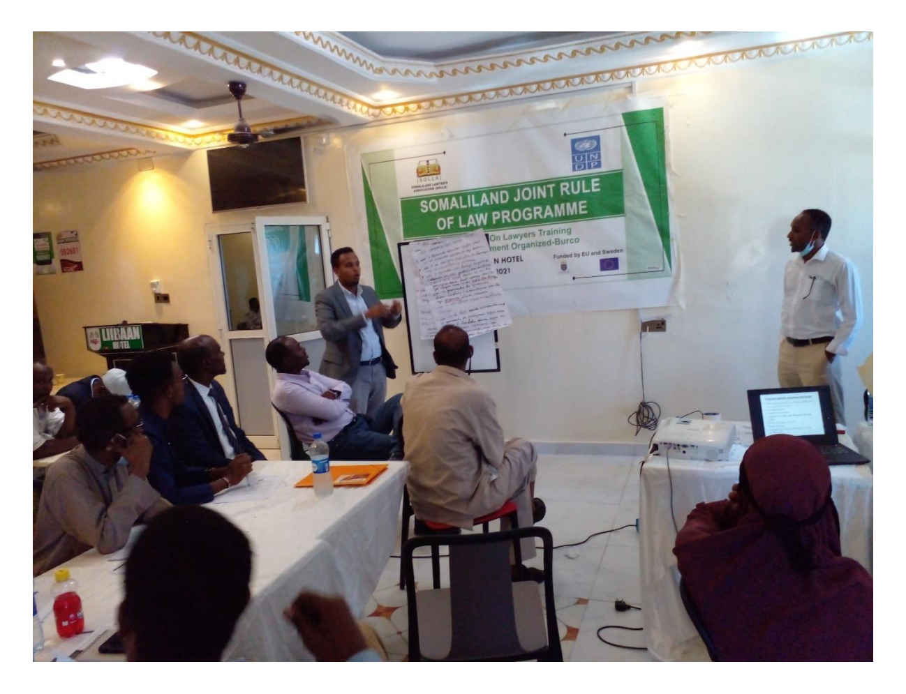
Photo of Group presentation during Burao TNA which was held at Liban Hotel on 27 Oct, 2021