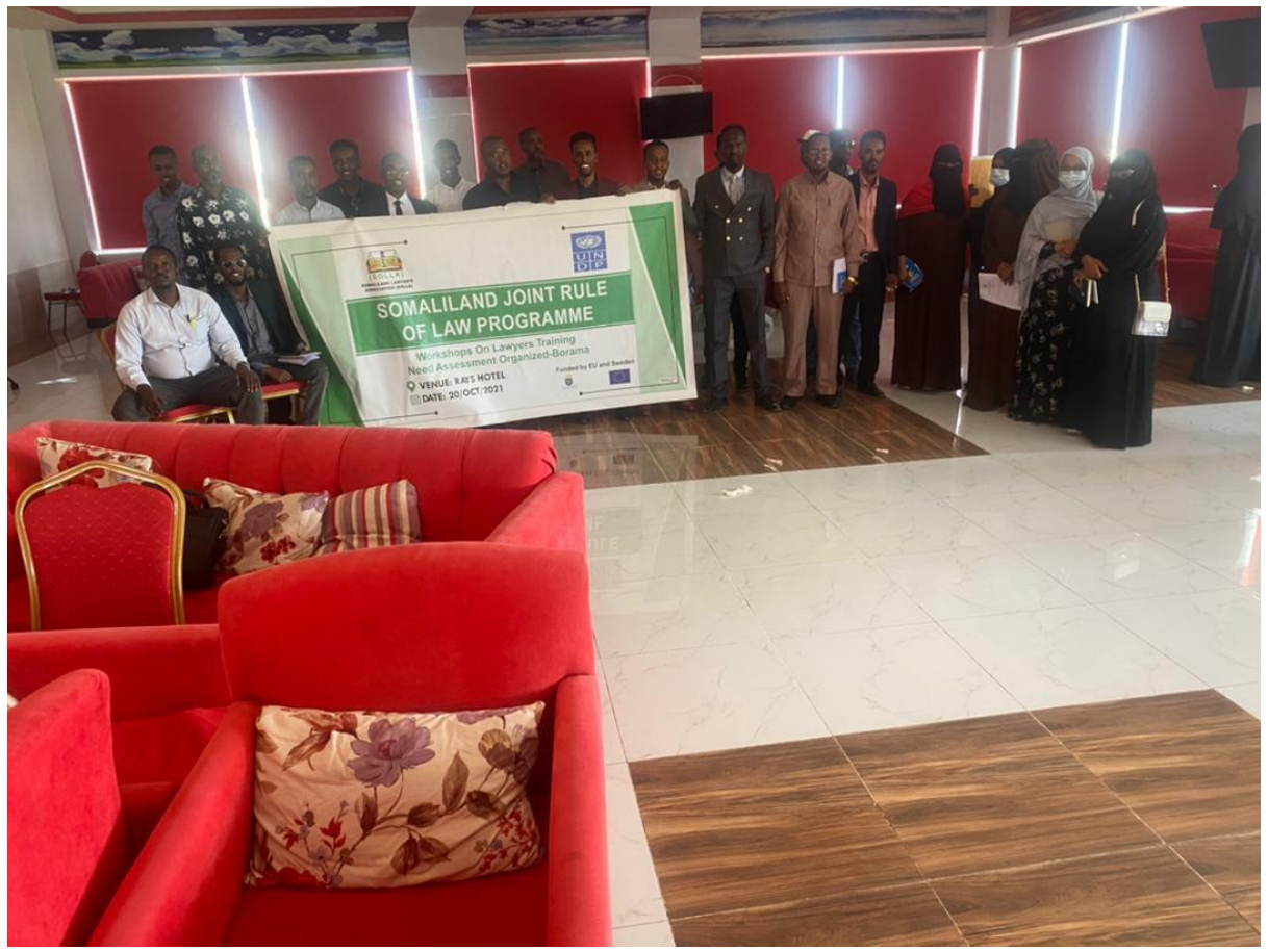
Photo Group of Borama TNA which was held at Rays Hotel on 20 Oct, 2021