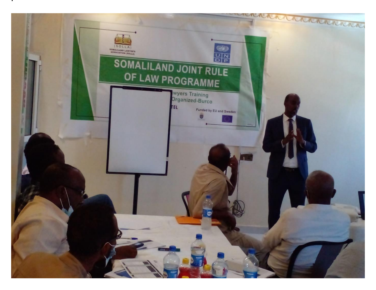
Photo of Solla's Chairman during the Group discussion of Burao TNA which was held at Liban Hotel on 27 oct, 2021

All participants of the three sessions that took place had expressed the significance on-job training sessions. They addressed existing gaps and the necessary areas of knowledge and skills that ought to be focused in the future proposals. In all sessions, participants have voiced that it is first time that assessment of the needs of legal professional are taken in ton consideration.