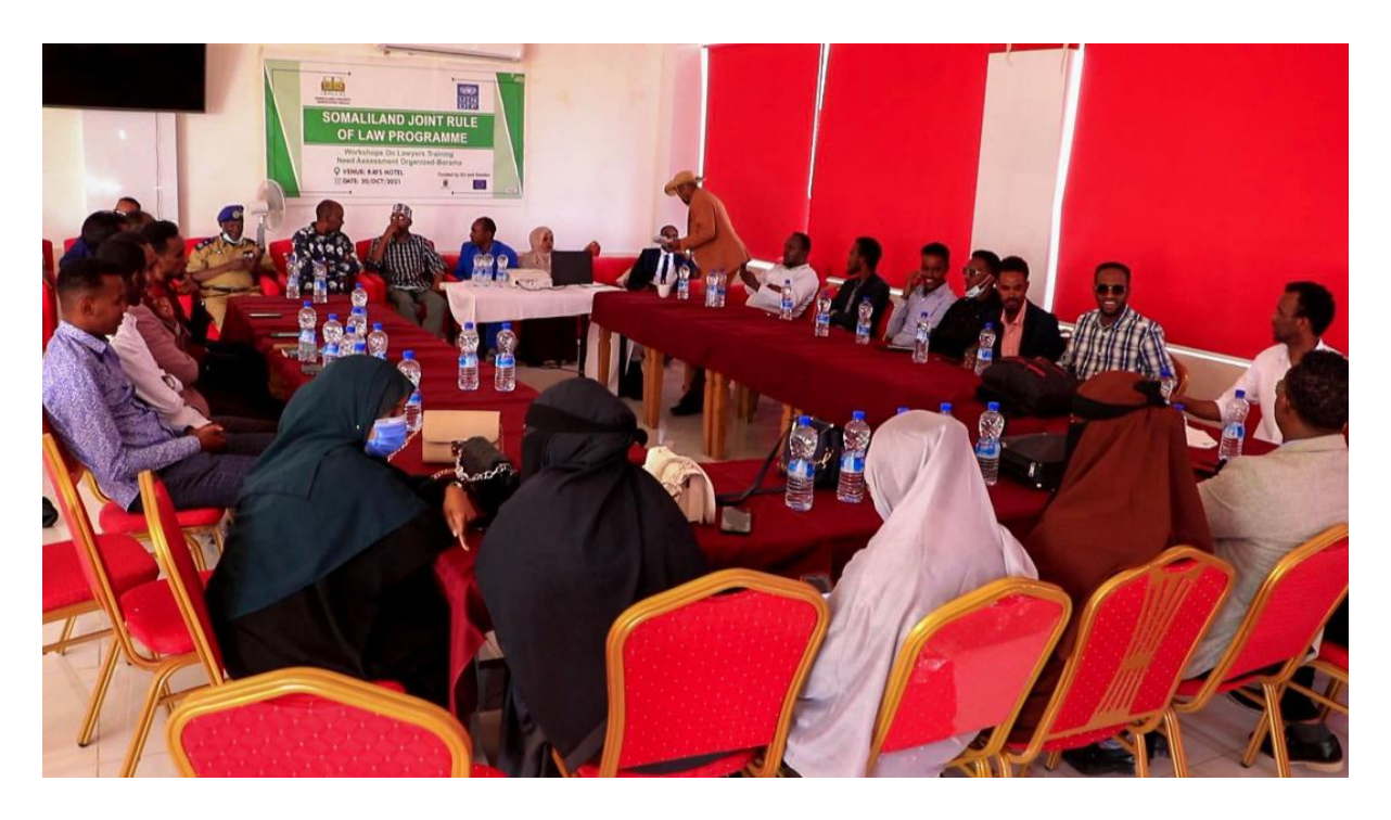
Photo of Borama TNA Workshop which was held at Ray's hotel on 20 Oct, 2021

Among other things, the workshop envisages the mobilization and organization of legal practitioners through establishment of discussion groups within the target areas. It is considered necessary that there is an urgent need to identify and categorize lawyer's actual training needs. There is no argument that lawyers, who have been relying more informal mechanisms, require carefully planned training programme catering to their specific needs. Identification training needs is, therefore, crucial to furnish Professional skills and attitudes that contributes professional efficiency in the administration of justice, since the main job of the lawyer is assist the court in dispensing justice.