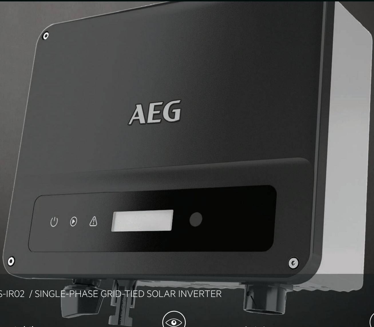
AS-IR02 / SINGLE-PHASE GRID-TIED SOLAR INVERTER