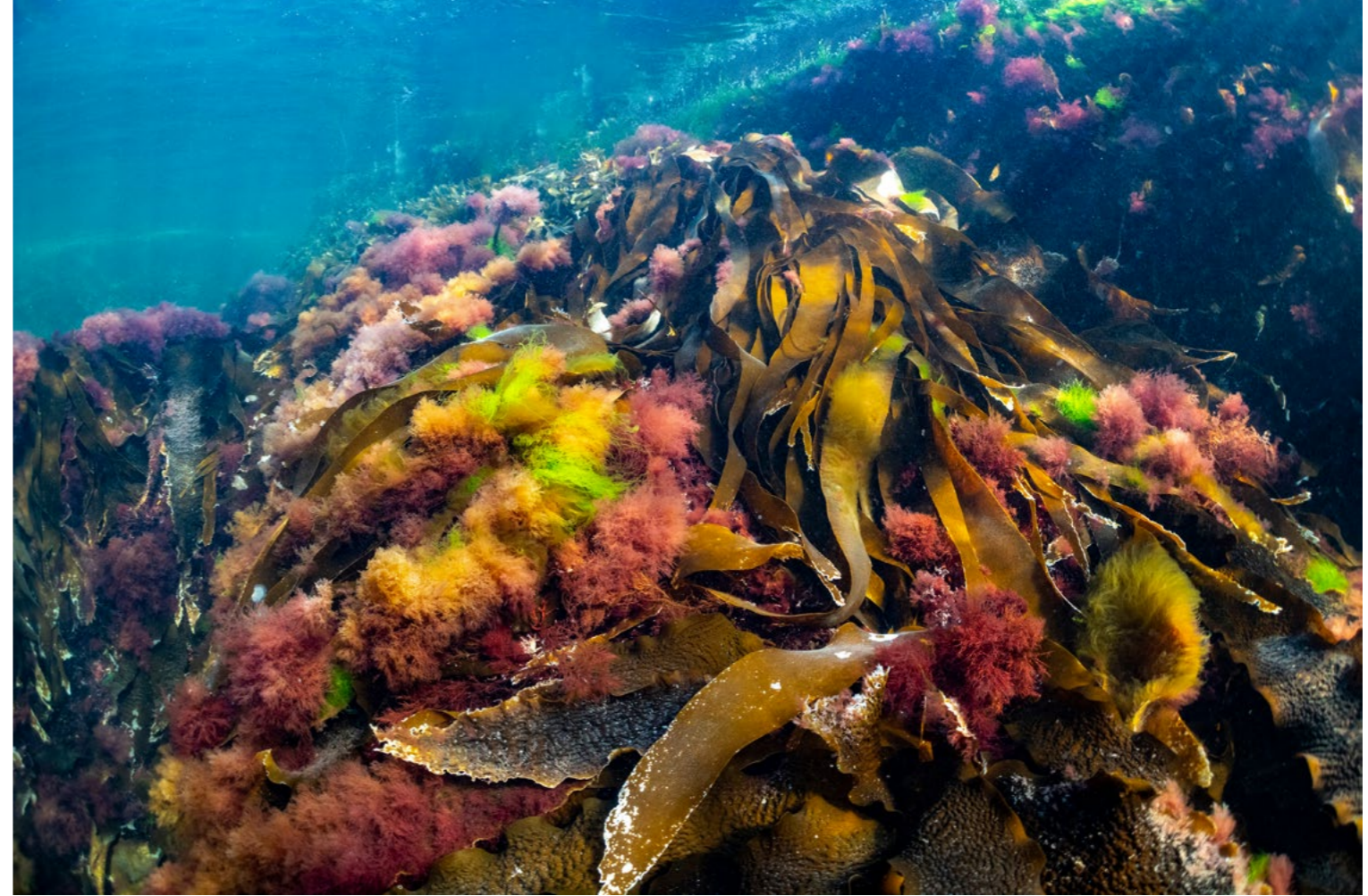
Dive Environment category, First Place: Fredrik Blomqvist (right)